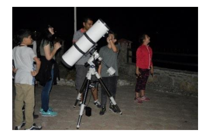
Figure 2. First day activities of the science and nature camp

2^{nd} Day: To support participants' career choices for the STEM areas, students engaged astronomy and archeology. With the "My Eyes are Always on Sky" activity, students learned developing strategies to create an artifact and discovering. Using advanced technological tools (telescope), they discovered the scientific knowledge underlying these tools. In addition, they created their own artifacts working with their peers. "The Nature of Science: Archeology" activity followed by "the Typical Day for a Scientist: From Mythology to Archeology" activity, they had a holistic point of view towards science by comprehending the relationship between STEM and social sciences. In the evening, with the activity "Astronomy I", they experienced the using of advanced technological tools and made sky observations with their own handmade telescopes (see Figure 3).