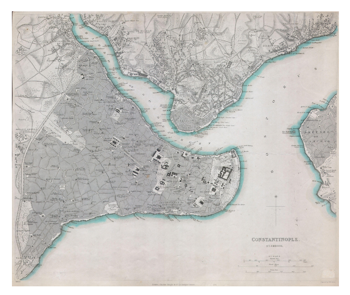
Figure 3. 1840 S.D.U.K. Map of Constantinople