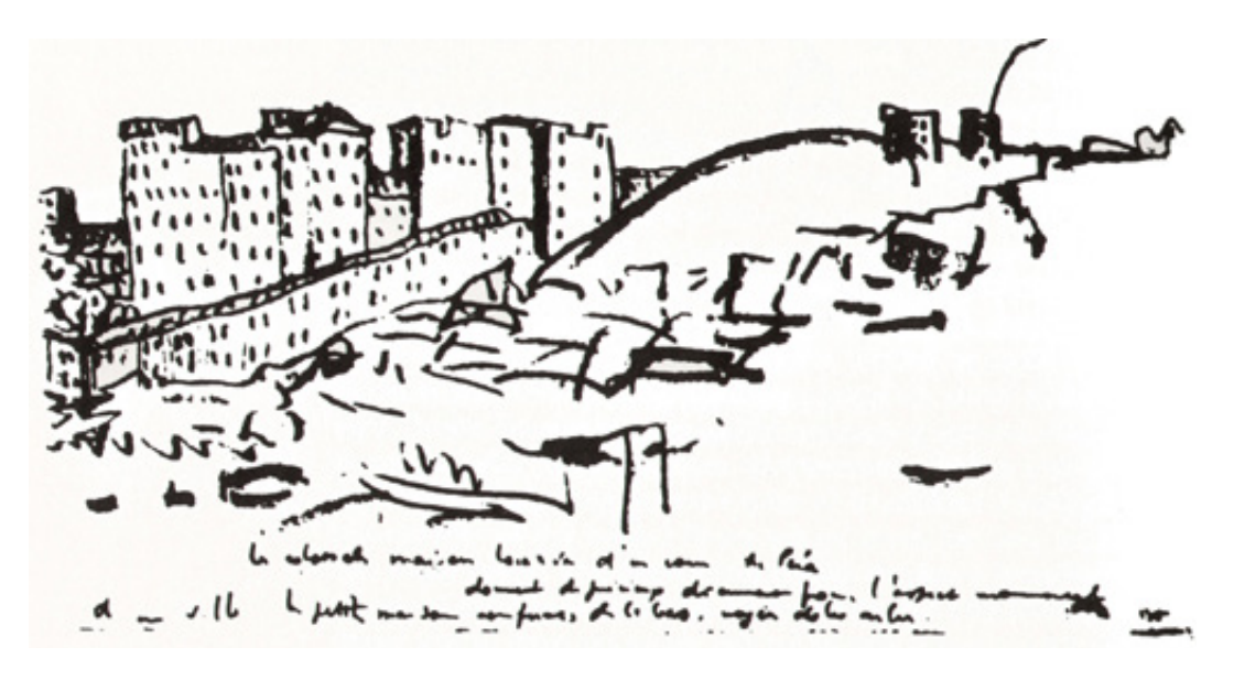
Figure 2. Apartments of Pera from the perspective of young Edouard Jeanneret, Le Corbusier, 1911