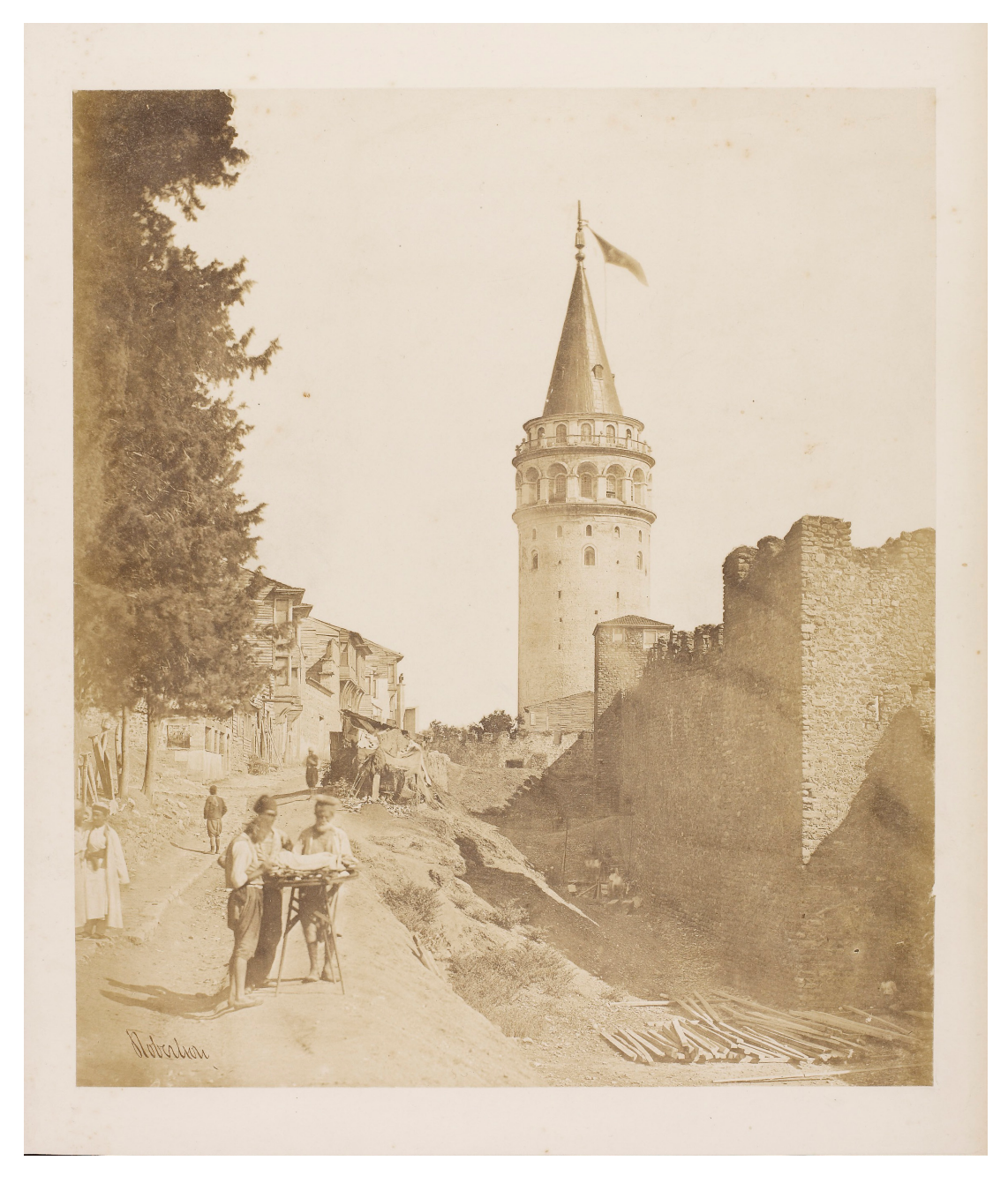
Figure 4. The walls of Galata before the demolition.