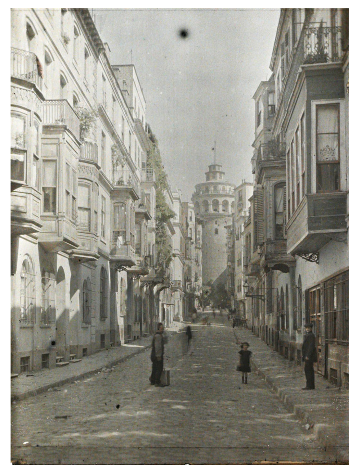
Figure 5. New row of apartments built after the demolition of Galata walls.