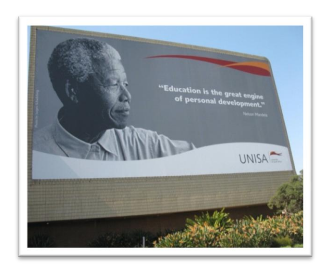
Figure 3: Education for empowerment begins with lived experience