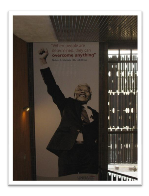
Figure 4: Mandela epitomises the mission of UNISA, namely to strive to overcome obstacles

Mangcu (2014) stresses that the challenge facing South Africa is to remember that freedom and democracy need to be worked at. He draws on Isiah Berlin's "Two Concepts of Liberty" and stresses that fighting for freedom successfully does not make one democratic. Keane (2009) cautions that for democracy to survive – let alone remain vibrant, it requires the active engagement of everyone in society.