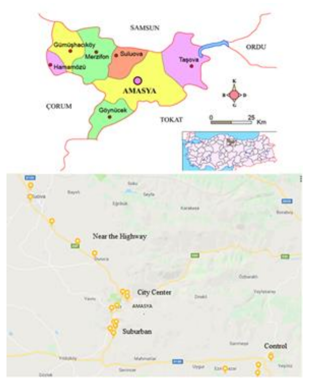
Figure 1. Sampling areas on the map

prepared as herbarium samples. Plant samples were washed twice with tap water and then with distilled water. As a result of the washing process, the plant samples were divided into three parts as root, stem and leaf and kept in the oven at 70 °C for 24 hours. After drying, the samples were ground. Samples for analysis were added with 10 ml of concentrated nitric acid (HNO<sub>3</sub>) and 2 ml of hydrogen peroxide (H<sub>2</sub>O<sub>2</sub>) and burned. The amounts of heavy metal accumulated in soil and plant organs were determined as three replicates (ICP-OES) and the obtained data were evaluated (Çayır and Coşkun, 2007). All data were analyzed using SPSS (18.00) statistical package program.