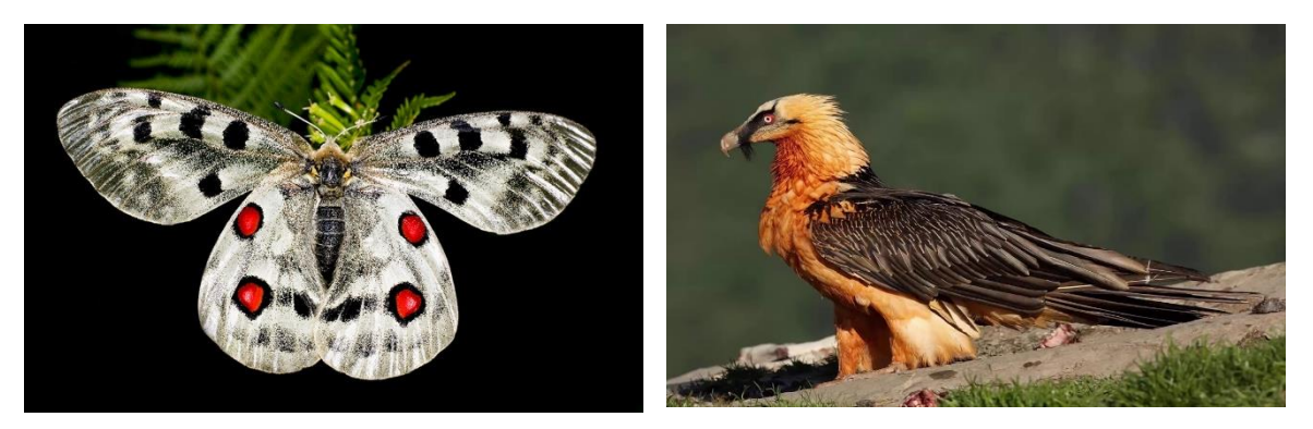
Figure 4. Left: Apollo Butterfly ( Parnassius Apollo L.) and Right: Bearded Vulture ( Gypaetus barbatus L.)