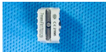
Figure 2. Bladed cervical peek cage (Spain) used in our patients

The evaluation changing in cervical axis assessed by the visual analogue scale and 'patient Healing', assessed by the Odom's criteria. Statistically rating is done by SPSS Programming Languages. For numerical variables we use student-t testing and for nominal ordinary variables we use pearson \chi^2 testing For Odom's Criteria 13 .