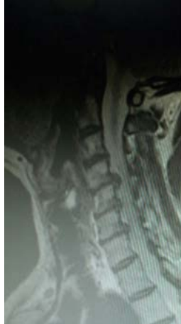
Figure 5. Preoperative sagittal magnetic resonance imaging of C4-5, C5-6, and C6-7 level HNP, osteophyte, and osteophyte.