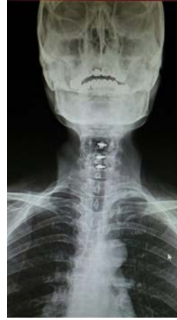
Figure 6. Postoperative anterior and posterior direct radiograph of C4-5, C5-6, and C6-7 bladed cage.