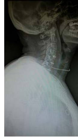
Figure 7. Postoperative lateral direct radiograph of C4-5, C5-6, and C6-7 bladed cage.

Quadriplegia, which was 3/5, became 2/5 by worsening in our patients, who had four distance cervical interventions, and in three of our patients, who had three distance cervical interventions, at the postoperative early period. Treatment with methylprednisolone was initiated according to the NASCIS protocol in the early period. Three patients recovered and underwent short-term passive physical treatment program. However, two patients did not recover based on the desired level. Superficial wound infection was observed in one patient, and appropriate antibiotic therapy was provided.