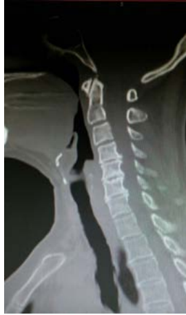
Figure 4. Preoperative sagittal computed tomography scan of C4-5, C5-6, and C6-7 level Herniopathy (HNP), osteophyte, and osteophyte.