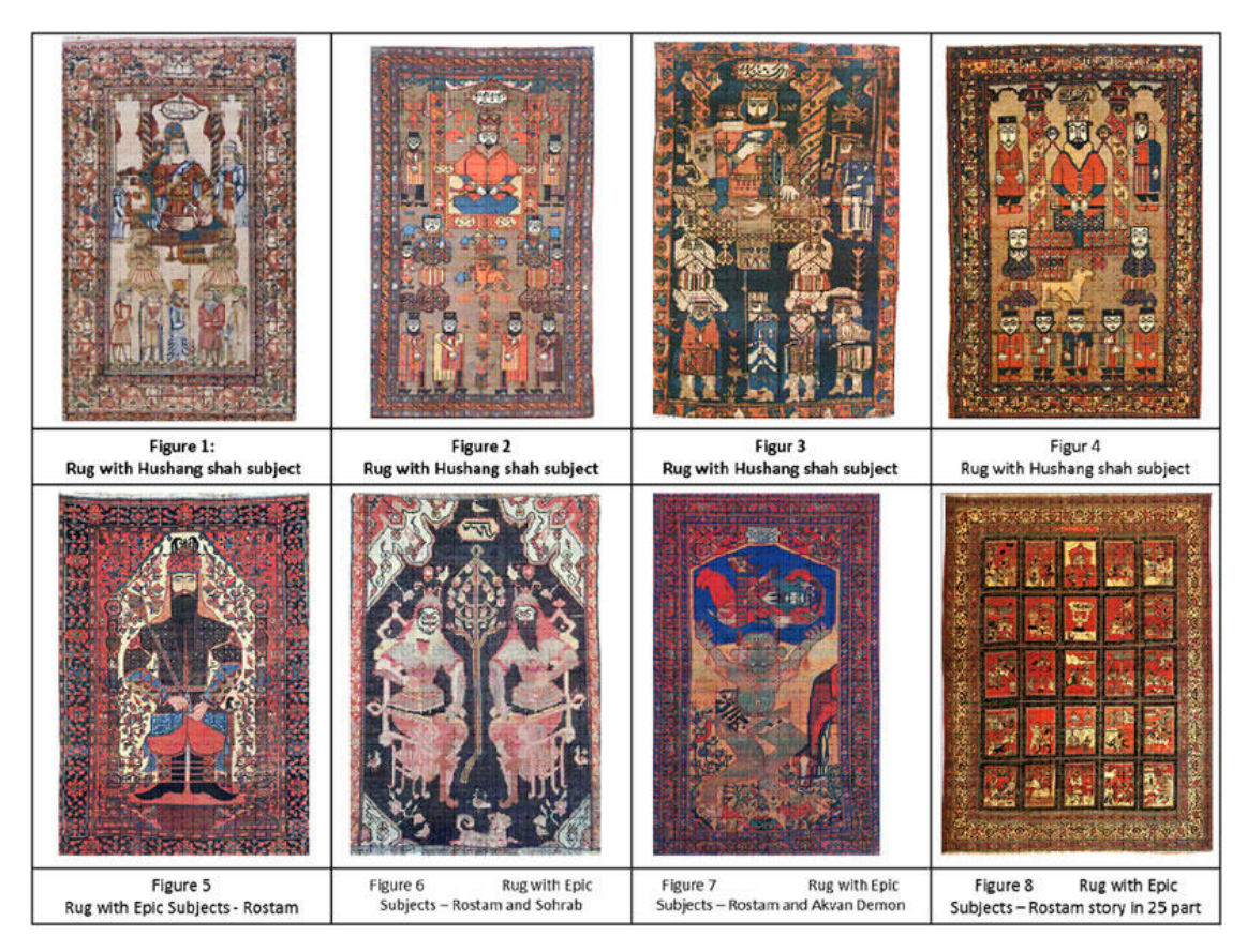
Table 3: Figure 1 to 4 is pictorial rug (handmade carpet) with Hushang Shah subject and figure 5-8 is pictorial rugs with Rostam subjects – epic story.

the other establishes agriculture. Hushang is assumed as the king of 7 countries and the demons and wizards ran away from him (Amoozgar, 2002)".