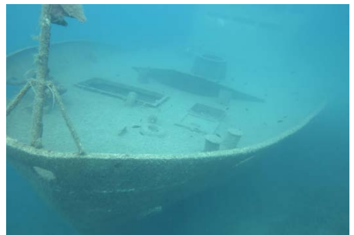
Figure 4. Underwater view of the shipwreck