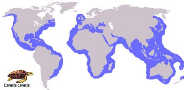
Figure 1. Spatial distribution of the Caretta caretta (Calim, 2010)

et al., 2018). There are a total of eight species of sea turtles in the world. Among them, the species Dermochelys coriacea , Ertmochelys imbricate , and Lepidochelys kempii found in the Mediterranean Sea but not nesting; Chelonia agassizii , Lepidochelys olivace , and Natator depressus species that are not found in the Mediterranean Sea, and Chelonia mydas and Caretta caretta species prefer coasts of Turkey for laying eggs (DEKAMER, 2009). Würtz (2010) reported that sea turtles were found in 10 countries on the Mediterranean coasts for both feeding and spawning.