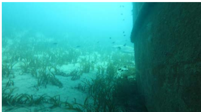
Figure 6. Caretta caretta species around the shipwreck