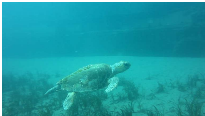
Figure 5. Caretta caretta and shipwreck

An adult male Caretta caretta species was recorded during underwater observations on January 2019 (Fig 5, Fig 6, and Fig 7). We observed C. caretta resting at a depth of 25 m and the water temperature was 13°C. The loggerhead sea turtle was disappeared after 5 minutes of observation. The estimated curve carapace length 60 cm and width 40 cm.