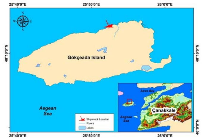
Figure 2. The location of the shipwreck

Caretta caretta species is one of the two species that prefer the coasts of Turkey for laying eggs (Würtz, 2010). Caretta caretta species was observed the first time around the shipwreck of coast guard boat in Ordek Yalağı located at Gokceada Island, North Aegean Sea (Fig. 2). This shipwreck artificial reef was sunk on October 2016 and found between the depths of 22.6 – 24.8 m parallel to the shore (Fig 3 and Fig 4). The name of the ship was TCSG 132 which scrapped from the coast guard. The length of the ship is 40.3 m and the width is 6.4 m.