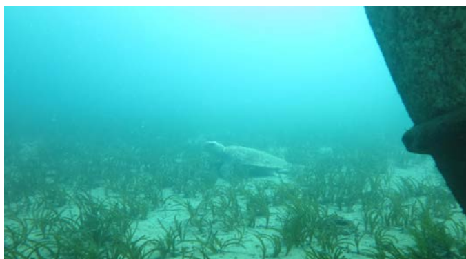
Figure 7. Caretta caretta in the Posidonia sp. seagrass