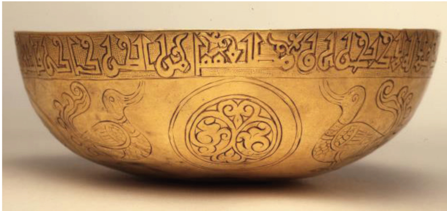
Picture 2. Golden cup with the images of birds, plants, and inscriptions (Dadvar & Zojaji, 2015: 81).

Plant images: in the Iranian art, plants are significant both in terms of economics and tools for expressing the Islamic worldview in the form of visual arts (Enayat, 2008: 36). Images of plants have an especial place in the Islamic arts. These images constitute a large part of decoration in the Islamic arts. In fact, it can be claimed that most Islamic themes such as geometry and arabesque are rooted in the images of plants (Vaziri, 1994: 56). The images of plants including trees – referred to as shajar in Quran – refer to anything which grows on earth (Okhovat, 2009: 75). In the Saljuqid era, different plant images such as cornflower and seven-flower – especially in the Khorasan School of metalwork – were used. The tree of life was used in most of the metalwork of the Saljuqid era (Picture 3). This tree symbolizes heavenly powers, the resurrection day, life and death (Sadagheh, 1999: 142). In most cases, there are guardians standing next to the tree of life, such as real and mythical animals. This means that to reach the tree of life one needs to fight these animals (Debucoart, 1994: 13). One can mention the cypress tree as another example of plant image used in the metalwork of the Sassanid era.