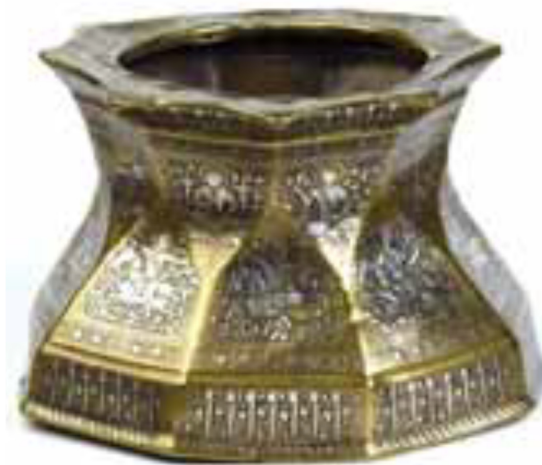
Picture 3. The candlestick in Iran's National Museum; it has inscriptions, human and animal images, geometric themes, and plant images such as the cypress tree (Bani-Emam, 2016: 35).

Plant images: in the Iranian art, plants are significant both in terms of economics and tools for expressing the Islamic worldview in the form of visual arts (Enayat, 2008: 36). Images of plants have an especial place in the Islamic arts. These images constitute a large part of decoration in the Islamic arts. In fact, it can be claimed that most Islamic themes such as geometry and arabesque are rooted in the images of plants (Vaziri, 1994: 56). The images of plants including trees – referred to as shajar in Quran – refer to anything which grows on earth (Okhovat, 2009: 75). In the Saljuqid era, different plant images such as cornflower and seven-flower – especially in the Khorasan School of metalwork – were used. The tree of life was used in most of the metalwork of the Saljuqid era (Picture 3). This tree symbolizes heavenly powers, the resurrection day, life and death (Sadagheh, 1999: 142). In most cases, there are guardians standing next to the tree of life, such as real and mythical animals. This means that to reach the tree of life one needs to fight these animals (Debucoart, 1994: 13). One can mention the cypress tree as another example of plant image used in the metalwork of the Sassanid era.