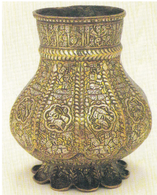
Picture 1. Human images with the themes of music and hunting on bronze urn (Ward, 2005: 56)

Human images: the use of human images in different forms such as, musicians, drinkers, horse-riders, hunting images, accession to thrones, mythological scenes and stories. The most widely used human images in the decorations of the Iranian art reflect parts of the court life (Shayestefard, 2005: 60). This includes hunting images, court life, sports, music, and war scenes (Picture 1). One of the most famous war images engraved on the objects in the Saljuqid era is about the siege of the Merv castle by Sultan Sanjar and his troops, which is found on a bronze pot in Dagestan, and is currently kept in the Hermitage Museum. In the war scenes, the warriors are shown as mounted and dismounted usually in pairs and fighting with different war equipment such as swords, daggers, shields, bows and arrows, and mace (Heydarabadian, 2009: 30). This method of decoration was initially used for recording historical events but in the Islamic period it was used for representing war scenes (Tohidi, 2007: 54).