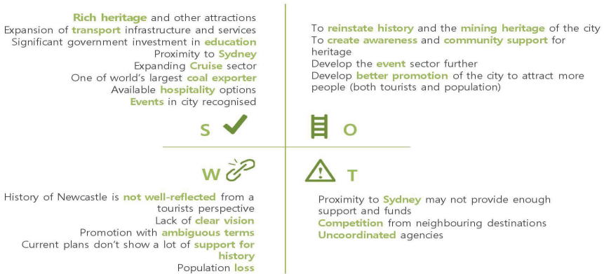
Figure 2. SWOT analysis

Lastly, the aim of this paper, through a comparative critical analysis of case studies was to show how to use the mining heritage in Newcastle (New South Wales - Australia) and how the findings might contribute to promote the city from a heritage perspective. The SWOT analysis (figure 2) helped in summarising some major elements to take into consideration for heritage tourism development and promotion. Firstly, it seems there is a significant drawback not being used. Since Newcastle is still a main stakeholder in coal production, and even today at global level, mining tourism development could be authentically grounded and could also benefit from an interpretation center for its present activities. As such, marketing and promotion could rely on a past-present thread through innovative partnerships with the coal industry to stimulate both industry and tourism economies.