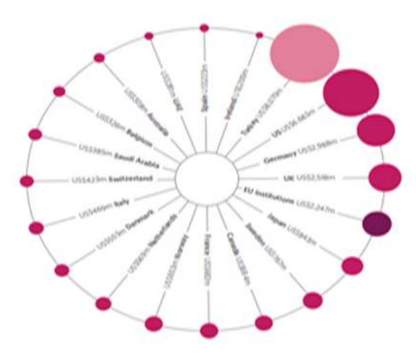
Figure 1. Contributors of The Largest Amounts of humanitarian Assistance, Goverments and EU Institutions, 2017

Of course, SSA Countries have been taking a substantial amount of this assistance and considering the further relations this, unsurprisingly, will continue. In recent years the scale of the trade between Turkey and African Countries has continually gone upwards. While the overall size of trade between Turkey and SSA Countries was around 4 billion US Dollars in 2010, this figure is now exceeding 7 billion US Dollars according to September 2018 data.<sup>16</sup> The volume of the trade is shown in detail below table.