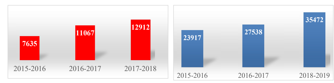
Table 2. African Students in Turkey

According to the table, the number of African Students is an increasing trend in comparison to the students from other countries. This increase has nearly doubled in the last three years. As of 2016, there are about 116 academicians in Turkey as well. Almost all students get scholarships from Turkey, his or her own country or the respected university.