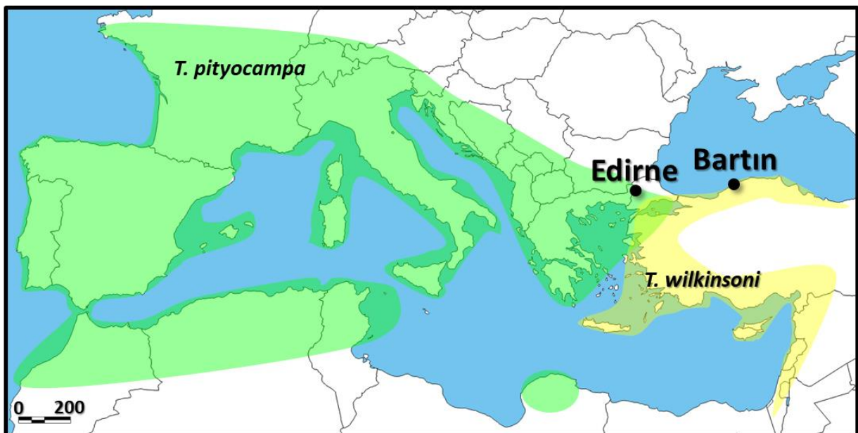
Figure 1. Distribution of pine processionary moth species and sampling locations.

We collected egg batch samples from Pinus nigra Arnold in 2017 between October 23rd and 25th in Bartın and Edirne. We visited 5 and 2 locations and collected 61 T. wilkinsoni and 11 T. pityocampa egg batches from different altitudes (30-260) in Bartın and Edirne, respectively (Figure 1, Table 1) (see İpekdağ et al. (2015) for molecular taxonomic identification of the pine processionary moth species in Turkey).