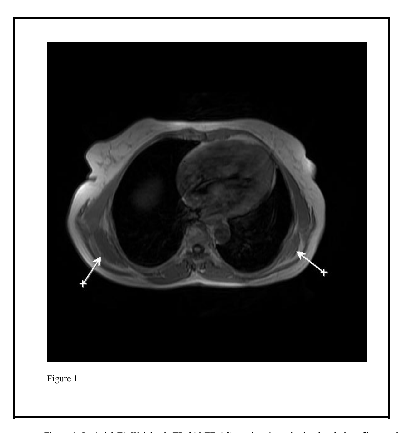
Figure 1. In Axial T1 Weighted (TR 215/TE 4.2) section, irregular bordered elastofibroma dorsi is detected in infrascapular region (arrows).