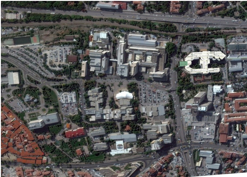
FIGURE 4. Beytepe Campus – general view (present)