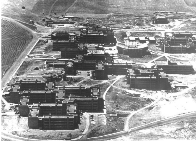
FIGURE 2. Early days of establishment of Beytepe Campus

Hacettepe University Beytepe Campus was considered as a rural area when it was founded in the 1970s. However, from that time to present, the area was evaluated as a suburban and urban area, respectively. In order to make this situation clearer, the change in the campus in about 50 years has been presented in the following images (Figure 2, 3, 4).