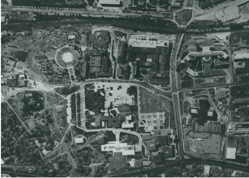
FIGURE 3. Beytepe Campus – general view (in 1990s)