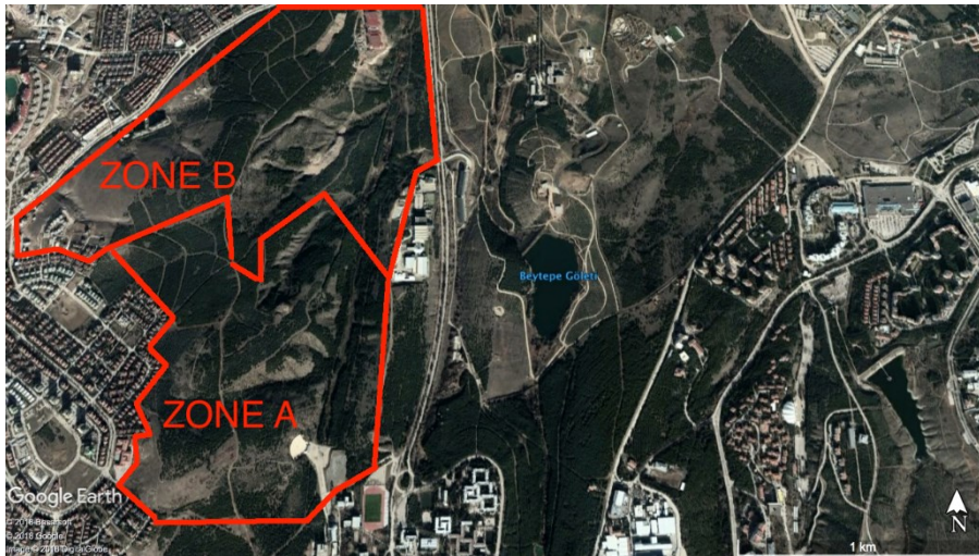
FIGURE 7. Studied area view in 2018 (after constructions)