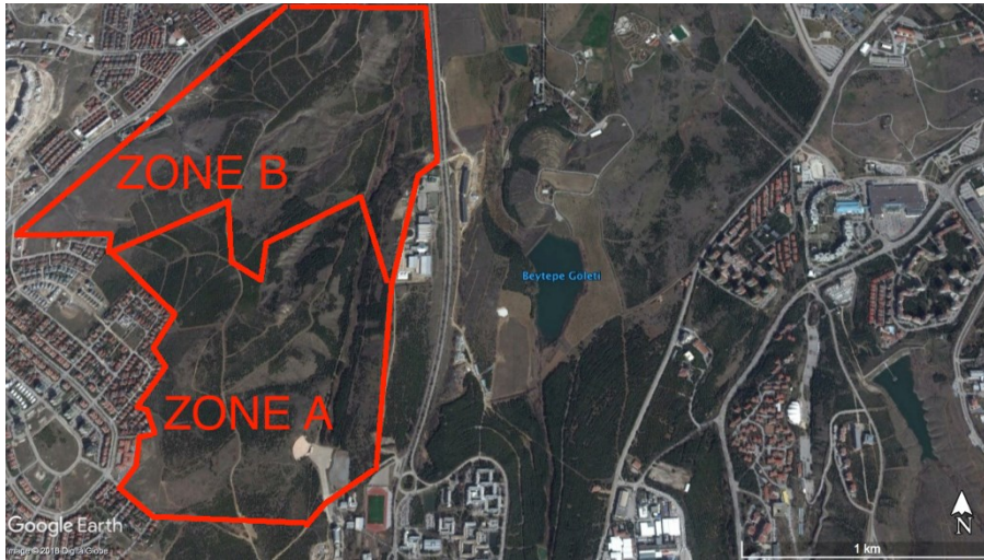
FIGURE 6. Studied area view in 2015 (before constructions)