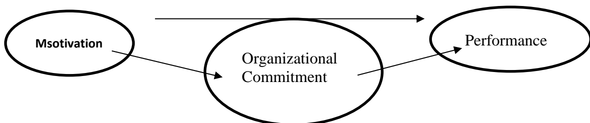
Figure 2. Relationship Model of Work Motivation, Organizational Commitment, and Performance

The model can also be expressed in the form of equations, thus forming the following system of equations.