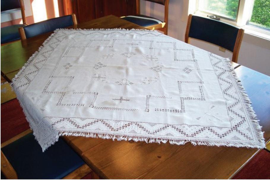
Figure 8: Lefkara Lace Tablecloth