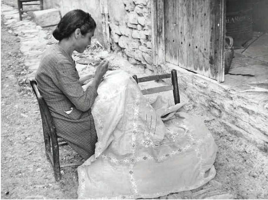
Figure 4: Photo from the Past (Cyprus Inform, 2016)

Almost every source talk about the technique of the lace, which is still difficult. One of the main specialities of Lefkara Lace is that its back looks the same as the front. It is also a repetition of geometric patterns with only one colour wool and only one ball of wool in a piece. The main patterns are always framed with supporting patterns around them. In a basic version, Dolgu (Filling), Kesme (Cutting), Sarma (Wrapping), Acur and Kenar (Side) knitting techniques are used. In addition, the patterns are based on ethnic patterns (Ekingen, 2016). Due to these main specialities, the lace has always been respected.