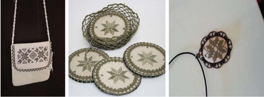
Figure 10: Lefkara Lace Bag (Lefkara Corner, N/A)

In terms of perceiving and caring about Lefkara Lace, people value it more than they did in the past. The given value can be understood by people's not preferring to use it with the aim of protecting it. These have caused it to be produced in smaller scales and decreased the usage as parts of interior decoration.