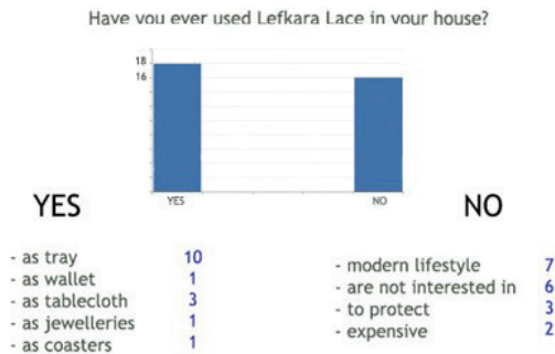
Figure 8: Statistics