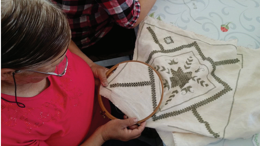
Figure 7: Woman with Lefkara Lace

Compared to non-producers' interviewees, these women think, Lefkara Lace production will decrease. Young people do not have enough time and patience to learn and produce. On the other hand, they mentioned the usages will decrease too.