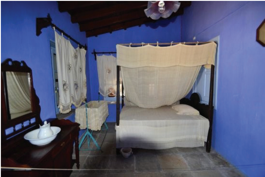
Figure 6: Interior

Interviewees believe with these new versions of usages, which actually had been started for tourists' attraction; local people have started to support it more. On the other hand, they also agreed that usages will increase. "I think it won't be used as cloths, trays because our lifestyle has changed a lot. But maybe, as panels, decorative accessories it may be used more." said the interviewee #2.