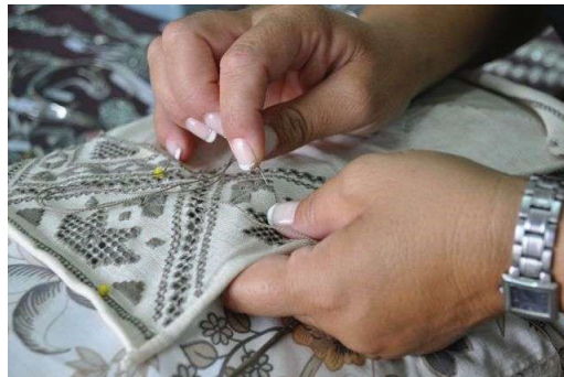
Figure 3: Producing Lefkara Lace (Pier, 2012)

Ekingen (Ekingen, 2016) mentions about history, techniques, materials, variations and origins of Lefkara Lace. She says that there should definitely be more research about Lefkara because it is about to be extinct. According to the legends, Cypriot women learnt the lace from Venetian ladies during the Venetian period in Cyprus, which was from 1489 to 1570/71 and they continued the tradition until 1970s in Lefkara Village. The lace had spread all over the island after '74 War with migration (Ekingen, 2016). She mentions the materials were produced in Cyprus but after Cyprus Government, Irish Linen and French Yarn have been used. They have always been beige linen and tons of white, green and brown yarn (Ekingen, 2016) (Figure 3). Different options of usage of Lefkara in the past are classified as bed lings (Figure 5), tablecloths, chair cloths, curtains and lightings.