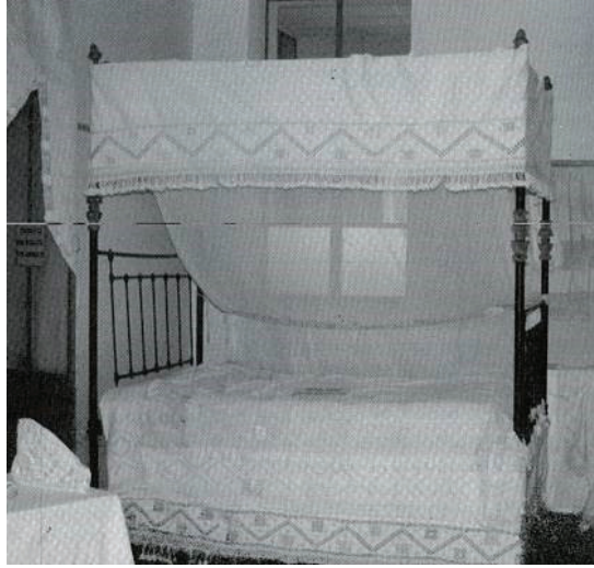
Figure 5: Bedlinen (Gounesco, N/A)