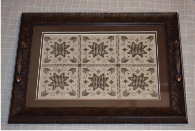
Figure 9: Lefkara Lace Tray (Lefkara Corner, N/A)

Although sixteen of them mentioned that they use it in their houses, they use it mostly as trays, not as part of interior decoration.