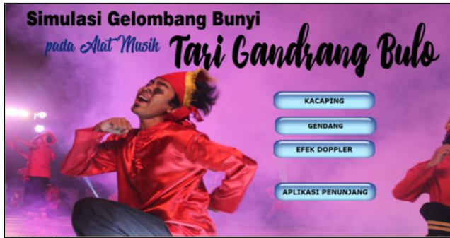
Figure 4. Design of Learning Media