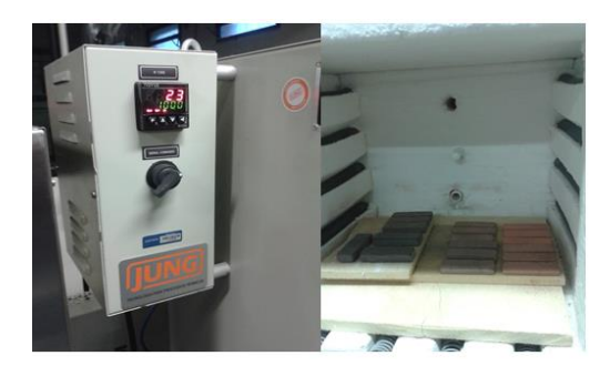
Fig. 4. Test piece burn

The test specimenwere wrapped in an oven as a muffle furnace for 24 hours at an increasing temperature from 0 to 1000 °C with one hour rest after the burnwas complete, as it's shown in Figure 4. According to the Brazilian Ceramic Association, after drying, the pieces must undergo a thermal treatment at high temperatures and for most of the products, the temperature is between 800 °C to 1700 °C, in continuous or intermittent ovens.