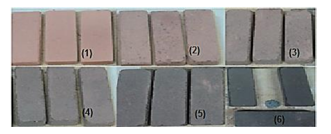
Fig. 3. Test specimen after pressing

E=thickness \quad C=Length \quad L=Width