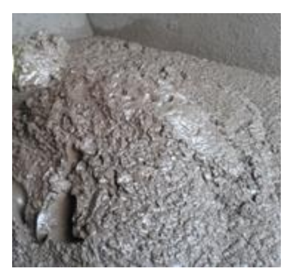
Fig. 1. Silicon industrial waste sludge

For the production of the test specimen, there were 2.5 kilograms of silicon industrial waste sludge in the Digital Timer microprocessor oven Sterilifer at 90 °C for 48 hours for dehydration. After drying, there was a gain of 0.250 kilograms that were ground until obtaining a very fine aggregate as it's shown in Figure 2.