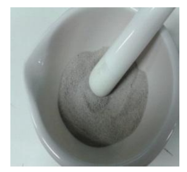
Fig. 2. Dehydrated silicon powder

Table 3 shows the mixture proportions of clay and silicon powder for the production of 18 rectangular testpieces in a scale from 0 to 100% of clay and silicon that were produced in a hydraulic press Shimadzu model and 120 kN capacity. The samples were pressed at 40 kN with the following dimensions described in Table 4 and noted in Figure 3.