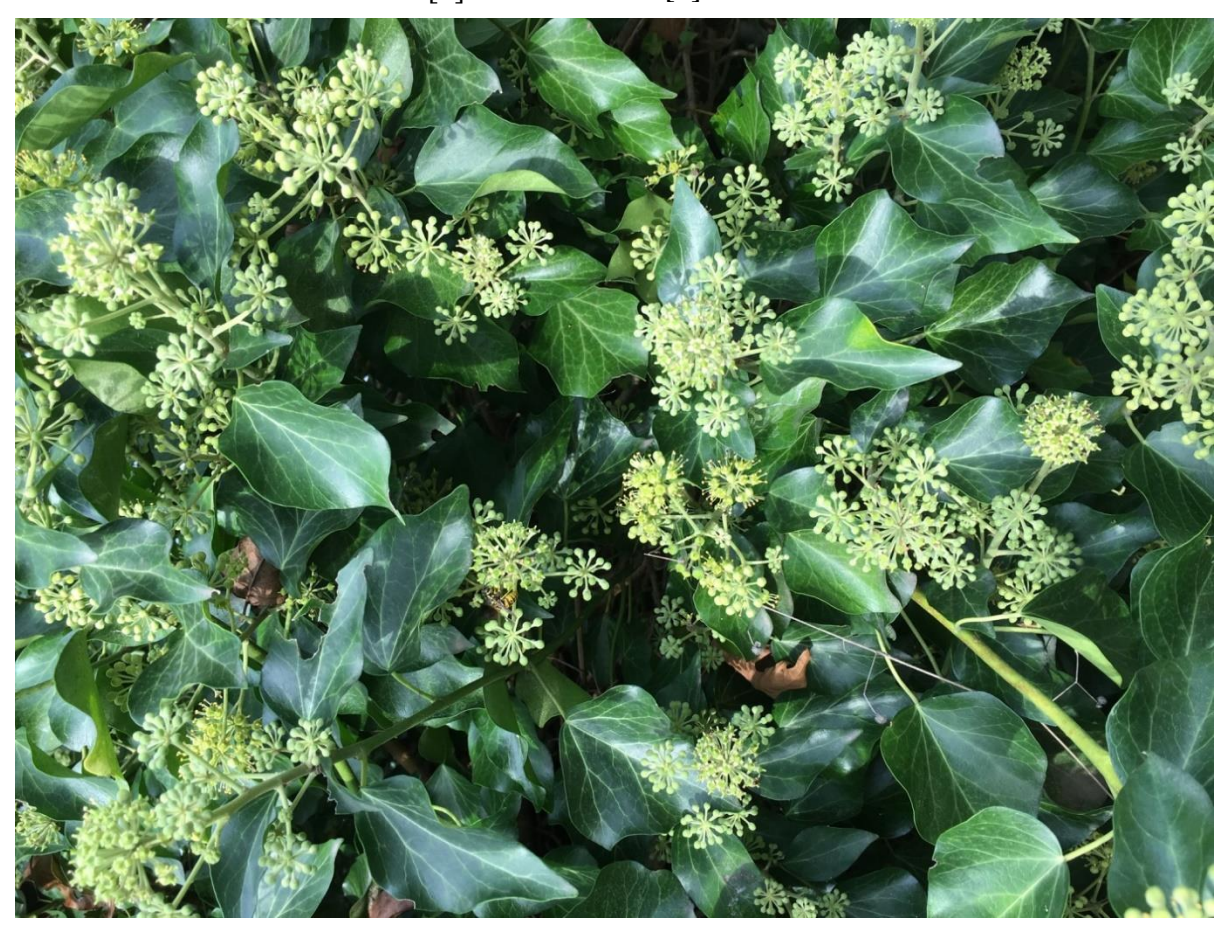
Figure 1. Flowers of H. helix

(2018) determined H. helix pollen in honey from Ereğli-Namık Kemal neighborhood [8].