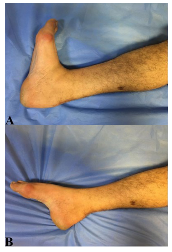
Figure 2.A and B. Clinical images of a patient underwent primary repair and plantaris tendon augmentation. Ankle dorsiflexion (A) and plantar flexion (B).

One patient suffered from superficial skin infection which was treated successfully with antimicrobial therapy. There were no cases of deep-vein thrombosis, skin necrosis, or re-rupture. Patients returned to their works in 12.8 weeks (10-18 weeks) on average (Figure 2).