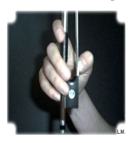
Picture 1. Suzuki bow hold for beginners Picture 2. Rolland bow hold for beginners