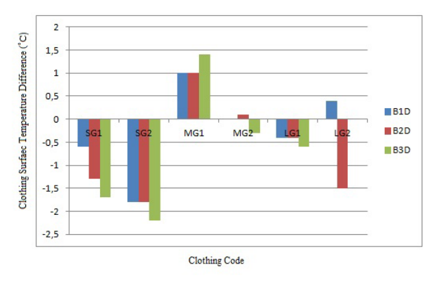
Figure 4. The clothing surface temperature differences on frontal body sections between first worn and after ten minutes

Three subjects having small, medium and large size, tried on two experimental tshirts (SG1, SG2, MG1, MG2, LG1 and LG2). The surface temperatures of on small size body (SG1 and SG2) have the lowest surface temperatures due to the highest air gap thickness. The SG1 and SG2 tshirts have not the close fitting as much as the others. After ten minutes, SG1 and SG2 shows the highest temperature decrease because the tshirts provide thermal isolation due to air gaps (Figure 4).