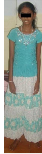
Figure 1a –Photograph showing Tall stature with thin body habitus

The patient was well oriented with time, place and was cooperative during the clinical examination. On examination, skeletal findings like tall stature with slender limbs, long narrow face (leptoprosopic), long narrow head (dolicocephalic), thin body habitus with increased arm span to height ratio, long slender limbs, long fingers and toes (arachnodactyly),