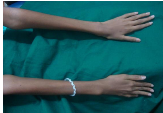
Figure 1b- Long slender upper limbs and fingers

deformities of the chest (pectus carinatum), abnormal curvature of the spine (scoliosis), joint hypermobility, flat feet, downward slanting palpebral fissures, malar hypoplasia were observed (Fig. 1a & 1b). Walker sign (wrist) and Steinberg sign (thumb) was positive (Fig 2a & 2b).