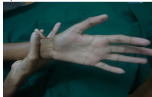
Figure 2a- Photograph showing wrist sign (Walker Sign positive)

deformities of the chest (pectus carinatum), abnormal curvature of the spine (scoliosis), joint hypermobility, flat feet, downward slanting palpebral fissures, malar hypoplasia were observed (Fig. 1a & 1b). Walker sign (wrist) and Steinberg sign (thumb) was positive (Fig 2a & 2b).