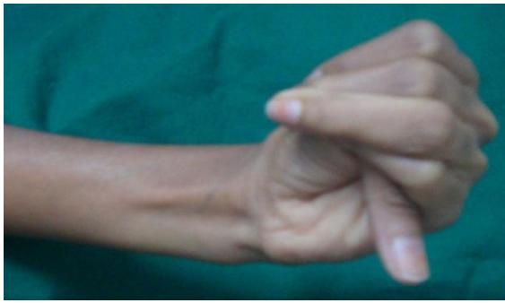
Figure 2b- Photograph showing Steinberg's sign

Ocular findings under slit lamp examination performed by a qualified ophthalmologist revealed ectopia lentis (subluxation of the lens) that was bilaterally symmetrical and upwards, blue sclera (Fig. 3).