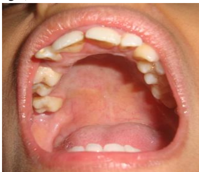
Figure 4-Photograph showing high arched palate.

Qualified cardiologist evaluated the patient and a electrocardiography was carried out which revealed no abnormalities. Oral findings were microstomia, incompetent lips, proclination of upper anteriors with high arched palate (Fig.4).