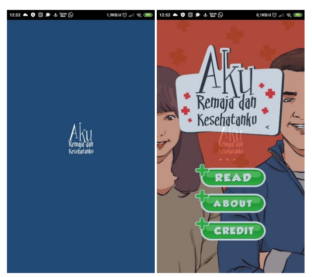
Figure 1. Digital front view flipbook in the application

Based on these results, the provision of digital flipbooks has not been able to increase knowledge and change students' attitudes. Researchers need to evaluate the implementation in providing this digital flipbook.