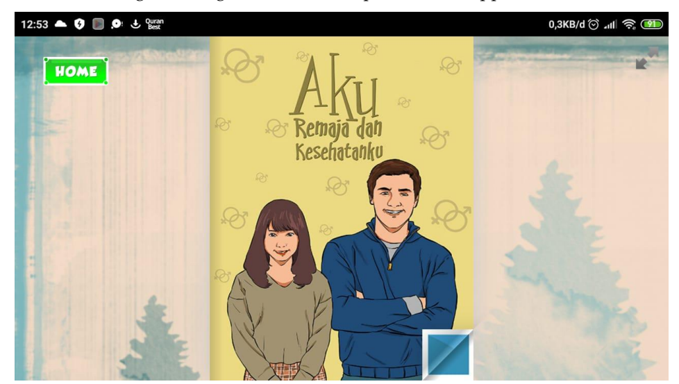
Figure 2. Cover of Digital FlipBook