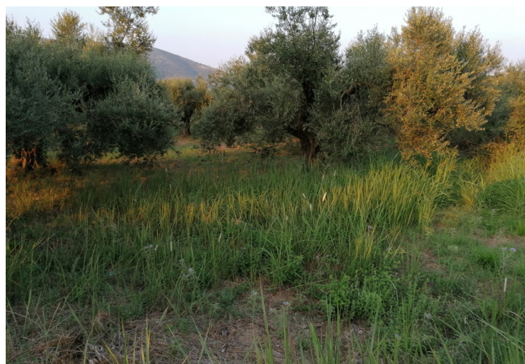
Fig 1. Olive orchard with a heavy Typha spp. infestation in western Greece.