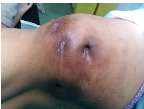
Figure 1: The patient gluteal fistulas at the emergency room

The patient was operated with exploratory laparotomy discovering a fistula between sigmoid and cecum as well as a fistula between cecum and the right wall. We first did a fistulectomy of the fistula between the sigmoid and the cecum, then we proceeded to an ileocecal resection with ileocolic anastomosis then we tried a resection of 4 apparent fistulas tracks in the gluteal region (Figure 2, 3). Informed consent was taken from patient.