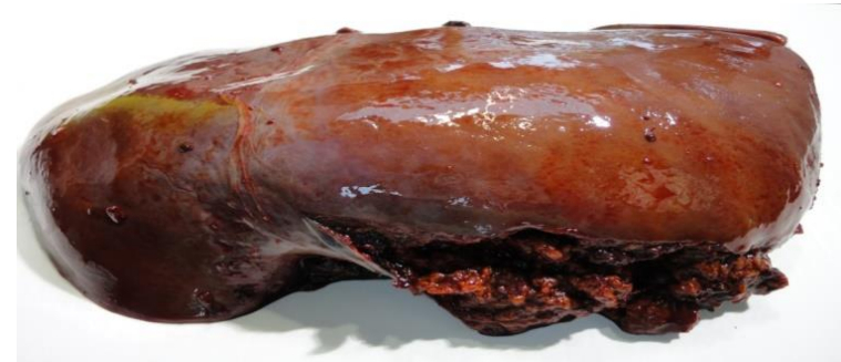
Figure 1. Hepatic rupture caused by trauma during difficult calving assistance.