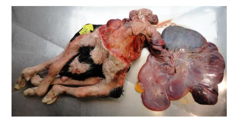
Figure 3. Congenital defect in a stillborn calf

Congenital defects may be defined as any defect in the foetus present at birth. The cause of many congenital defects is unknown, but some are inherited. Congenital defects can also occur as a result of genetic mutation, exposure to infectious agents, pharmaceutical teratogens and toxins (Whitlock et al. , 2008). The cause of some deaths will be obvious, others will be much more difficult to diagnose. Anatomical abnormalities are those most commonly diagnosed by veterinary practitioners and non-specialist veterinary diagnostic laboratories (Norquay, 2017). The incidence and types of congenital defects are highly variable depending primarily on the survey methodology. Hence, the number and types of cases submitted to veterinary institutions (research labs, routine diagnostic labs, and veterinary faculties) may differ greatly from those actually occurring on farms, and observed by veterinary practitioners, which are not submitted. This submission bias may result in fewer but more severe cases being submitted than non-submitted. In cases of perinatal mortality, congenital defects seen include intestinal atresia, arthrogryposis, cerebellar hypoplasia, cleft palate, omphalocoele, ventricular septal defect, schistosomus reflexus (Fig 3) and hydrocephalus, which can be readily detected at post-mortem examination (Mee, 2013b).