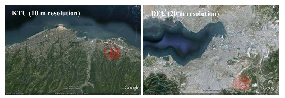
Figure 1. The location of Karadeniz Technical University in Trabzon and the location of Dokuz Eylul University in Izmir