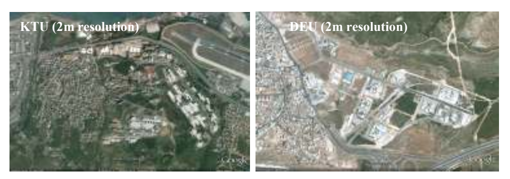
Figure 2. The aerial view of Karadeniz Technical University and Dokuz Eylul University