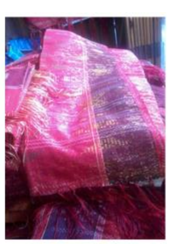
Fig 2. Ulos

Of the several types of Ulos above for now the most widely produced by the Weaving of Ulos Paulina Textiles Business Padang Sidimpuan of Indonesia is Ulos Sadum . This is because nowadays the use of Ulos Sadum is more used for certain events that can be used as memories, as decorations, souvenirs or for other functions. Besides that, the typical batik Tapanuli patterned Ulos is also produced by the Ulos Paulina Textile Weaving Business and also produces various forms and types of textile or custom clothing according to customer or consumer orders.