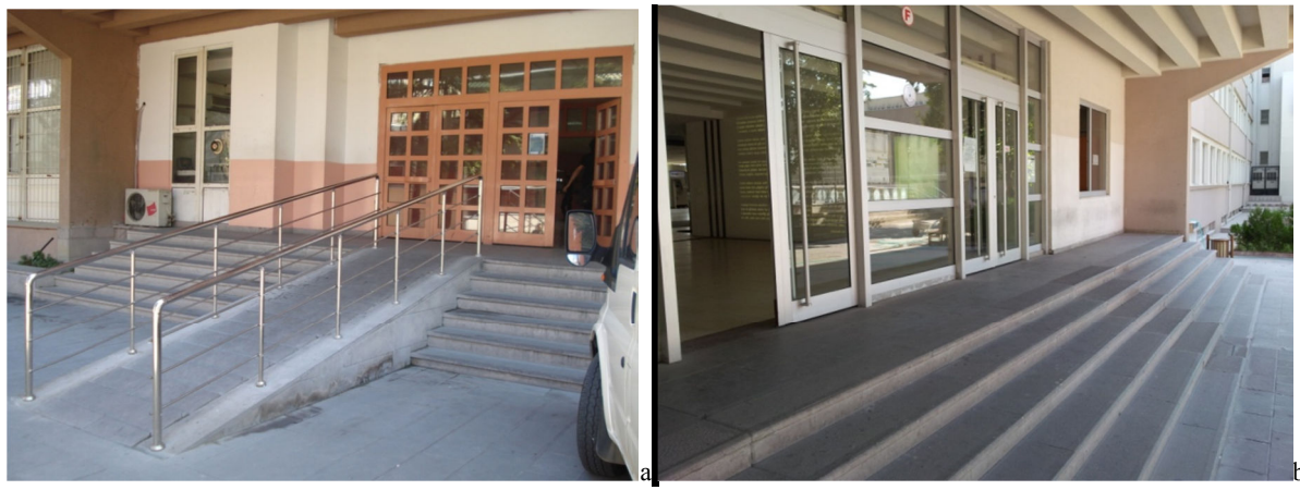
Figure 4 Sec.Building Entrance (to Site Ent-2-Closed CPA) with ramp a:2011, without ramp b:2012