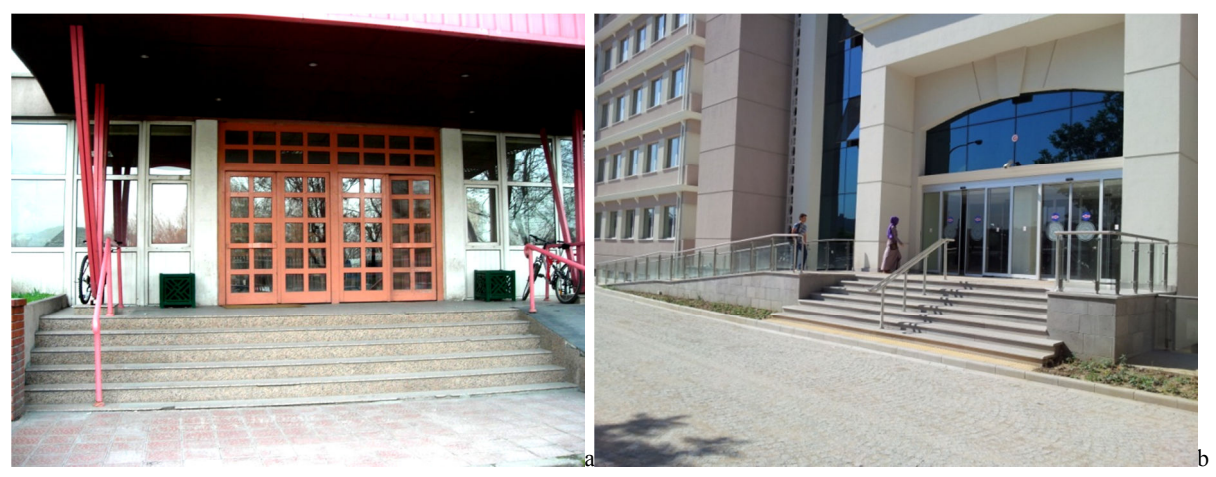
Figure 3. Primary Building Entrance (to-OPA-Site Ent-1) a: 2011, b: 2012