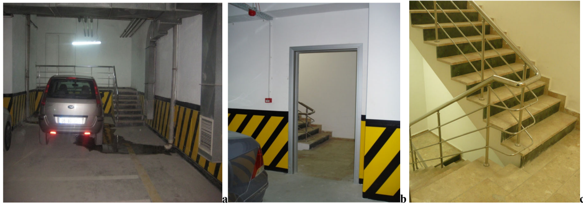
Figure 1. Closed Parking Areas (From SEN-3) a: 2012, (From SEN-2) b: 2012, c: 2012

still no accessible routes from the public transportation points or there is no parking space reserved for an accessible user compatible with TS 9111 in either parking area. No drop off area has been reserved and none of the sidewalks around the building are connected to roads or to each other with curb-ramps that are compatible with TS 9111. The signage and information at site entrances and the accessibility of the car parks, public transportation points and near surroundings have only slightly improved after renovation in 2011. Both closed parking areas has still no means of access to ground level by an elevator, stair ramp, platform lift or a ramp. (Figure 1) After the renovation in 2011 the site entrance 1 is equipped with curb ramps on the pavement and handicapped accessible gates. (Figure 2)