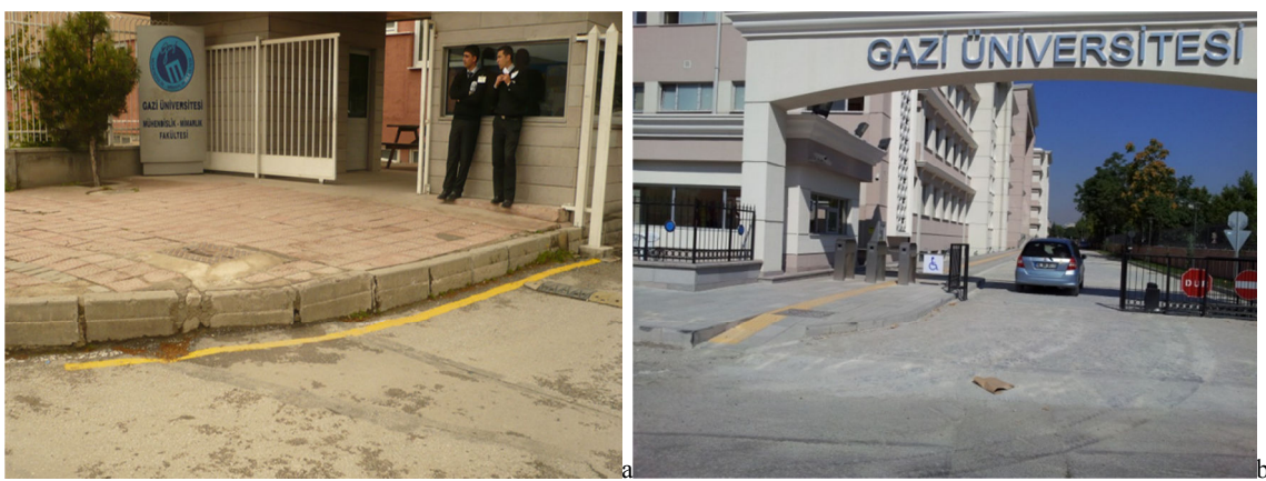
Figure 2 Site entrances (to Yükseliş street) a:2011, b:2012