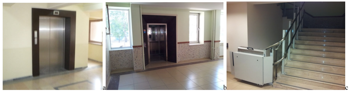
Figure 6. Elevators (Secondary Entrance) a: 2011, Newly installed elevator (Primary Entrance) b: 2012, Newly installed Platform Lift(Stairs-Conference Hall) c: 2012

stairs and elevators and other accessibility related devices have sufficiently improved after the renovation in 2011.