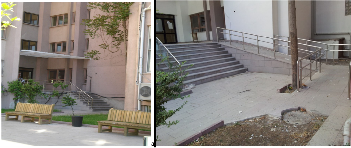
Figure 5 Sec.Building Entrance (to External Yard) a:2011, b:2012