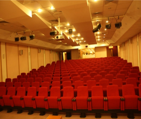
Figure 10. Conference Rooms (Akademi Salonu / Gr.Floor) a:2011, Conference Rooms (Yükseliş Salonu / Gr.Floor) b:2011