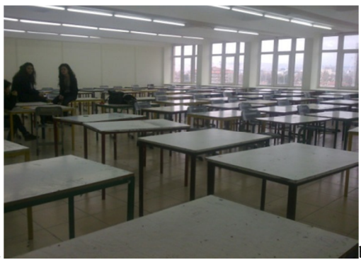
Figure 8. Amphi-type lecture rooms (314) a:2011, Atelier (307) b: 2011