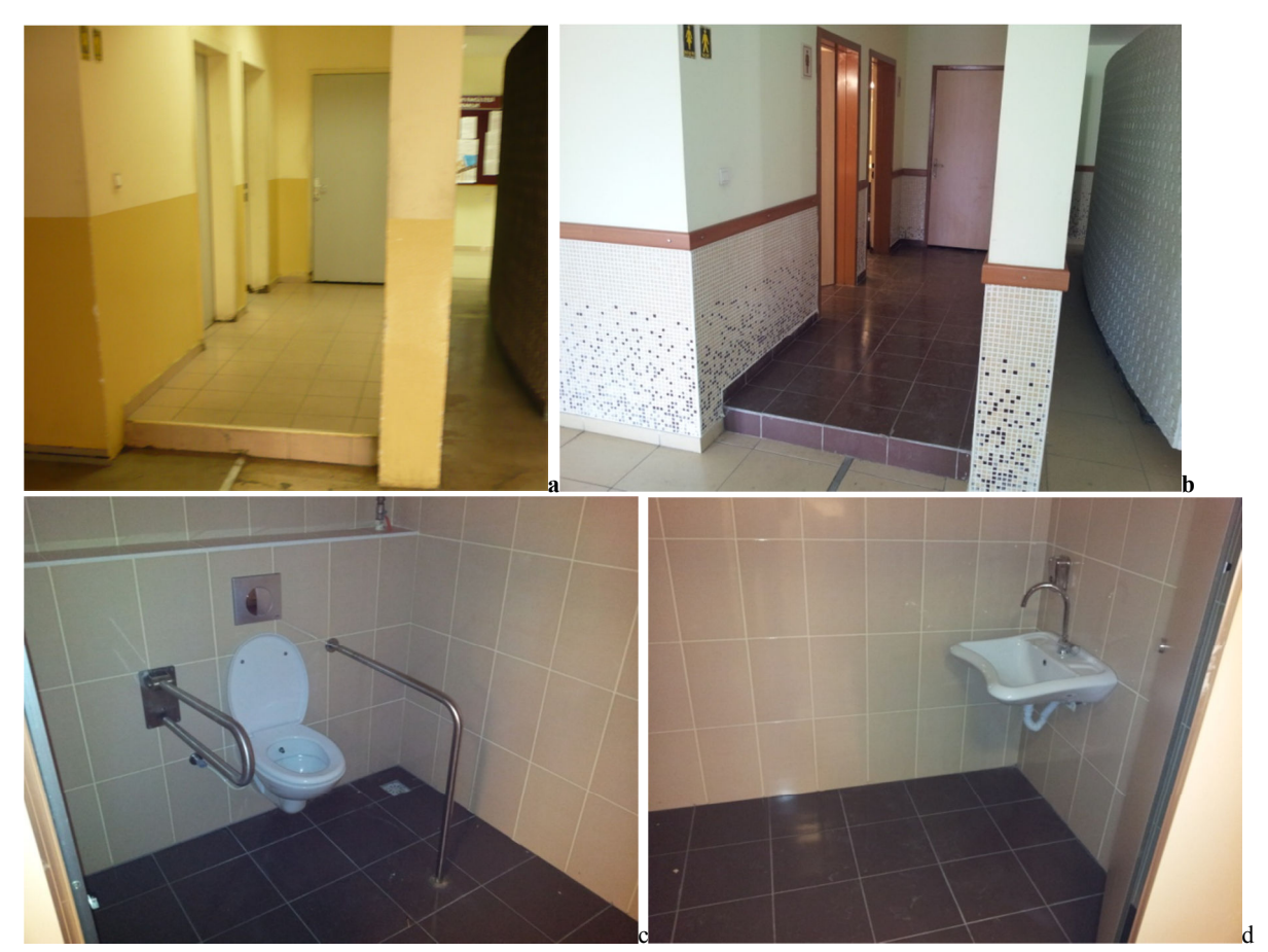
Figure 11: Water Closets (Ground Floor) a:2011, b: 2012, c: 2012, d: 2012

raising the toilet areas from level and no ramps are linking the toilets. (Figure 11) Another issue is that these cabins prepared appropriately for handicapped users are used as storage areas for cleaning equipment as there is no handicapped student attending the school. Minor improvements should be applied in order to have these wet spaces arranged appropriately for the handicapped students.