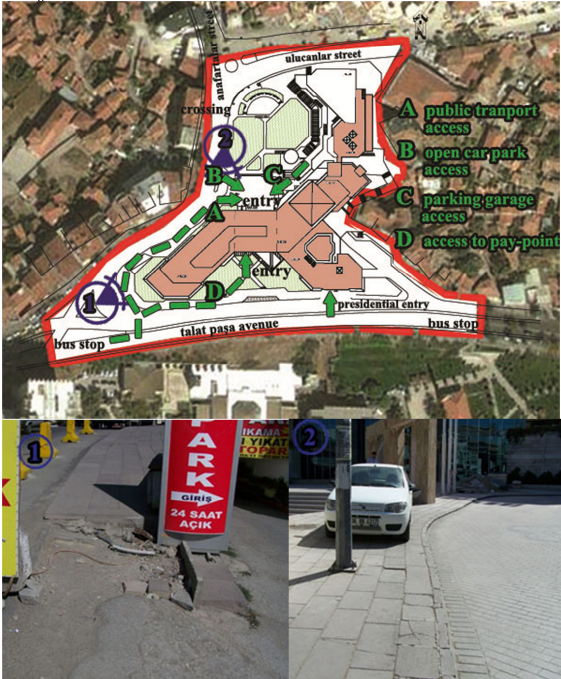
Figure 3 Non-even pedestrian walkways, deficient dimensions for accesible route, non signing with perceptible markings around / Non signed accesible car park, there are no curb ramp and non even pedestrians walkway Pavement road levels, non uniform external stairs / unprotected external stairs from weather conditions and lack of railings and non-slip markings around Altındağ M.S.B.

Some other deficecies regarding accessible route and signage are as follows;