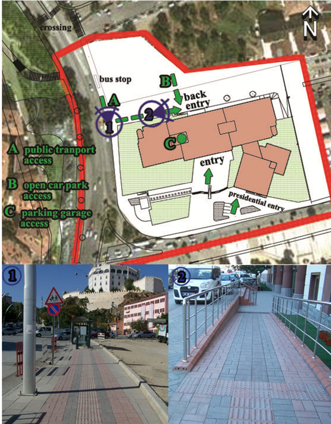
Figure 4 Enough dimensions for pedestrian walkways but obtrusive surfaces on lamppost / Low-slope ramp and perceptible (but not in contrasting colored) markings along the route / lack of informative signage / Non-conforming railings and protruding edges on each stairs around Keçiören M.S.B.