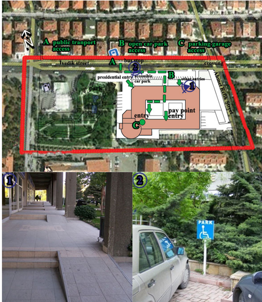
Figure 5 Lack of side railings and informative signage around / Low-slope ramp with no-perceptible markings along the route Yenimahalle M.S.B.