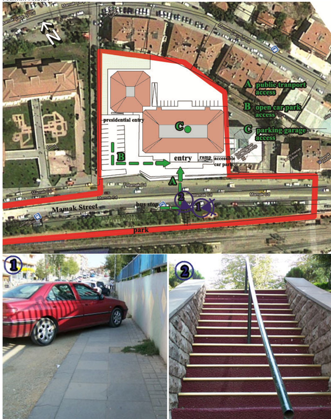
Figure 2 Even pavement-road levels causes obstructions on route / un-protected external stairs form weather conditions, lack of side railings and non-slip markings on edges of stairs / External ramp well designed but not protected from weather conditions and not signed with perceptible markings around Mamak M.S.B.

Some other deficiencies regarding accessible route and signage are as follows;