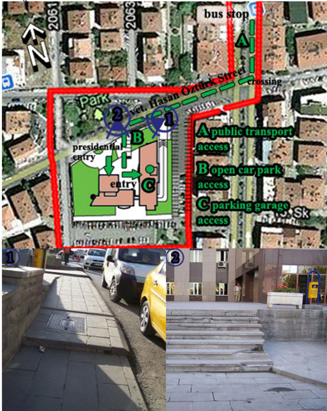
Figure 6 non-even pedestrian walkways along the route/ lack of side railings and informative signage / un-protected external stairs from weather conditions around Etimesgut M.S.B.