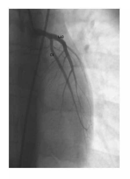
Figure- 2. Control coronary angiography performed after tirofiban infusion showing complete disappearance of the intracoronary thrombus.

clopidogrel and atorvastatin and he was well on 12 month follow-up. The patient was symptom free during one year of medical therapy with aspirin, clopidogrel, and atorvastatin.