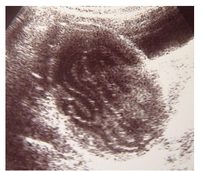
Figure 1. Ultrasonographic appearance of primary intraligamentary hydatid cyst: congealed "water lilly sign".

de sac that was suggested to have some kind of packed germinal layer inside with multiple curvilinear structures (Figure 1). The ultrasonography of other abdominal organs especially liver and spleen, chest x-ray and laboratory tests such as liver enzymes and tumor markers were normal.