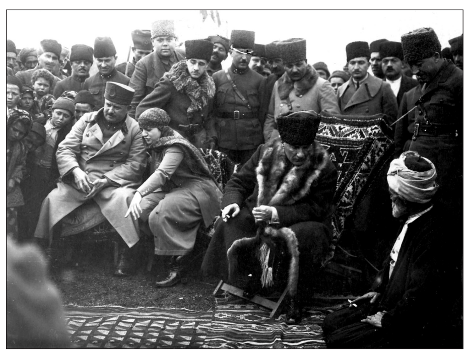
Atatürk and Latife Hanım in a meeting with the people in İzmir in 1923.

Contributions of the Turkish Eastern Army Under General Kazım Karabekir's Command to Turkish National Resistance and Peace-Making with the Caucasian Republics at World War-I and the Following Turkish War of Liberation