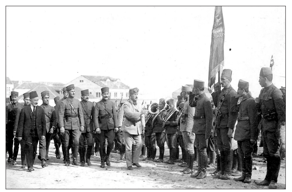
Inspection of troops being transferred from the Eastern to the Western Front.