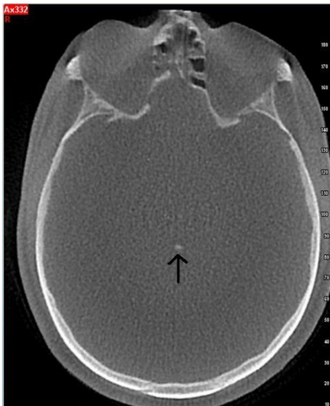
Figure 1. Axial cone beam computed tomography images of habenular calcification (black arrow)

The most commonly observed type of calcification and ossification was found to be habenular calcification with 48% within all evaluations (Figure 1). Table 1 represents the distribution of habenular calcifications based on gender, which was found significant based on the conducted Chi-square test of independence with p=0.028 . We found choroid plexus calcification in 8 patients and mostly recorded bilaterally. Habenular and choroid plexus calcification seen together in 6 patients.