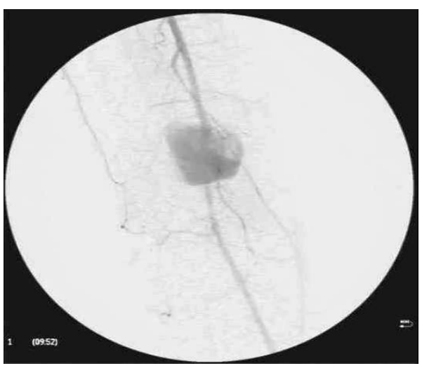
Figure 1: Preoperative angiography

Doppler. Ankle Brachial Index was measured as 0.6 at the right side. On the previously taken peripheral angiogram of the patient, a pseudoaneurysm of 55x36 mm was seen in the right superficial femoral artery (SFA) (Figure 1).