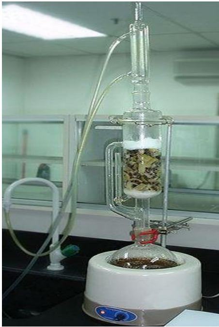
Figure 1: A Typical Soxhlet Extraction Set-Up