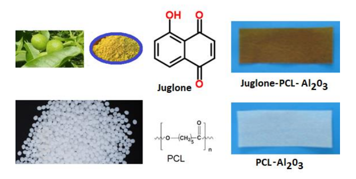
Figure 2 The images of composite films and chemical structures of Juglone and poly(ε-caprolactone)

Juglone-PCL-Al<sub>2</sub>O<sub>3</sub> composite films with 30% added alumina containing different percentages of Juglone (1% and 5%) were prepared using the roll-mill technique. The alumina and Juglone additives in the specified amounts were added into the PCL polymer melted at 100 °C and mixed. In the next step, the melted mixture was transformed into thin films using the roll-mill. The images of composite films and the chemical structure of Juglone and PCL were given in Figure 2.