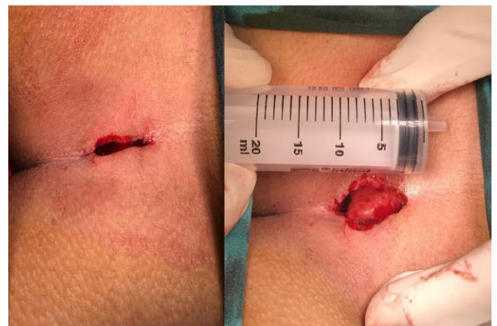
Figure 3. Postoperative appearance.