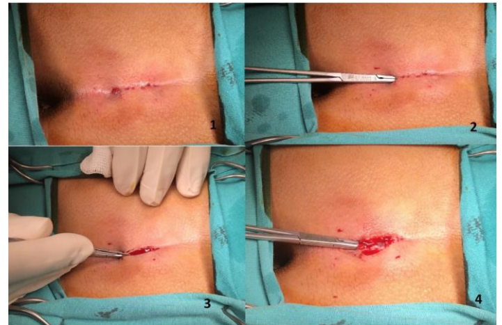
Figure 2. Stages of the surgical technique. 1. Appearance of the pits, 2. Determination of the sinus tract with a clamp, 3. Opening of the tract, 4. View of the sinus content.

In the jack knife position, the pilonidal sinus area and pits in the sacrum were determined. Each pit was inserted through a thin clamp or stylet to reveal sinus tracts. The skin on the tract was excised and the base was curetted (Figures 2 and 3). The wound was closed with wet dressing.