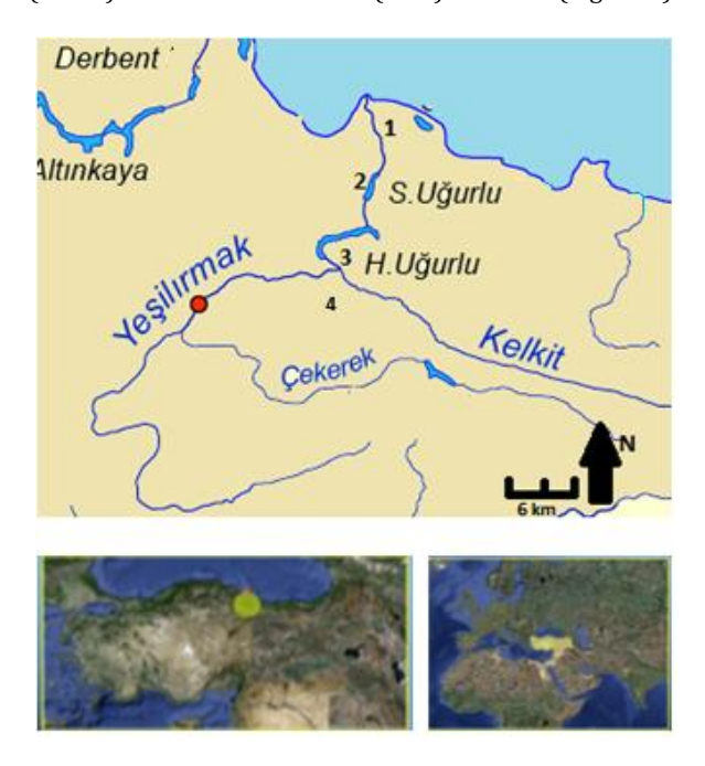
Figure 1. The stations in the study area.

Yesilirmak River is 2<sup>nd</sup> largest river (519 km) of Turkey. The river mainly consists of the merger of three branches, namely Tozanlı, Kelkit and Çekerek. The Kelkit is the biggest branch of the river. The alluviums carried by the river with its tributaries form Çarşamba Plain. Yeşilırmak, on which Almus, Ataköy, Hasan Uğurlu and Suat Uğurlu Dams are established, has an irregular regime (Anonymous, 2009). In this study, the sampling was performed at four stations; Dam Exit (DEX) river, site the Suat Uğurlu Dam Lake (SUDL), Hasan Uğurlu Dam Lake (HUDL) and the dam entrance (DEN) river site (Figure 1).