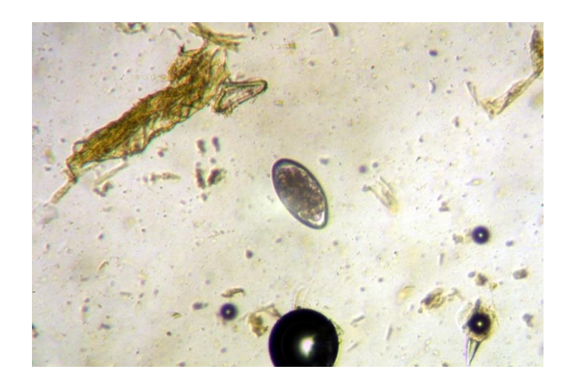
Figure 1. Haemonchus contortus egg.

chemicals is growing. Some breeds, such as the West African Dwarf goat and N'Dama cattle, are more resistant than other breeds to H. contortus (haemonchotolerance).