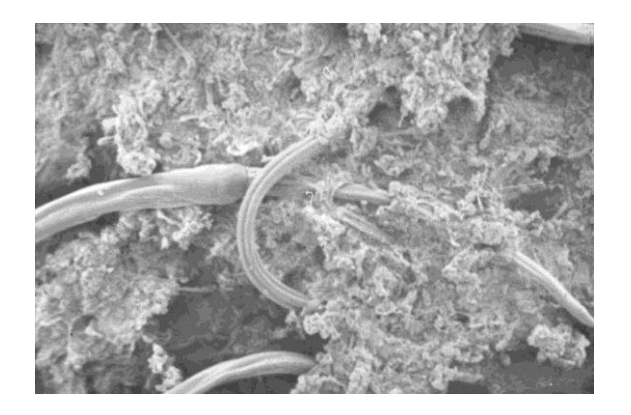
Figure 5. A scanning electron micrograph of Teladorsagia circumcincta .

emerge from the gastric glands, mature and breed. The prepatent period can be as short as 12 days. The number of eggs in the uterus of mature females can vary from less than 10 to more than 60 and is heavily dependent on the host immune response. The number of eggs produced per day by an adult female worm has been estimated as ranging from 0 to approximately 350, with longer females laying more eggs.