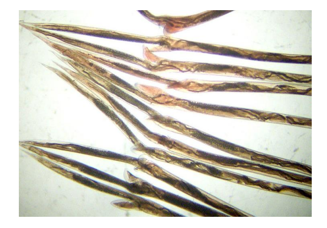
Figure 2. Haemonchus contortus adult females were taken from one sheep infected with a single strain of this worm species.

Clinical signs are largely due to blood loss. Sudden death may be the only observation in acute infection, while other common clinical signs include pallor, anemia, oedema, ill thrift, lethargy, and depression. The accumulation of fluid in the submandibular tissue, a phenomenon commonly called "bottle jaw", may be seen. Growth and production are significantly reduced.