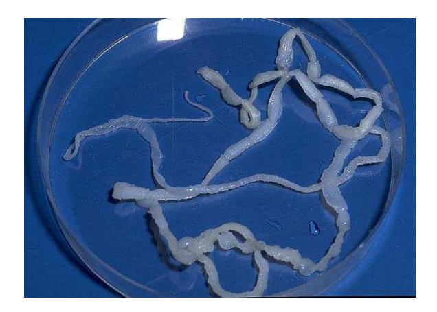
Figure 3. Taenia hydatigena in dog.

Like any other disease, the symptoms vary from its bodily location and when pertaining to the density of larvae. Many of the major symptoms are the result of inflammation during larval degeneration or a mass effect from the parasite. Neurocysticercosis is a serious form of cysticercosis. Common symptoms include chronic headaches and seizures. Other symptoms include: nausea, vomiting, vertigo, ataxia, confusion or other changes in mental health, behavioral abnormalities, progressive dementia, and focal neurologic signs (URL2).