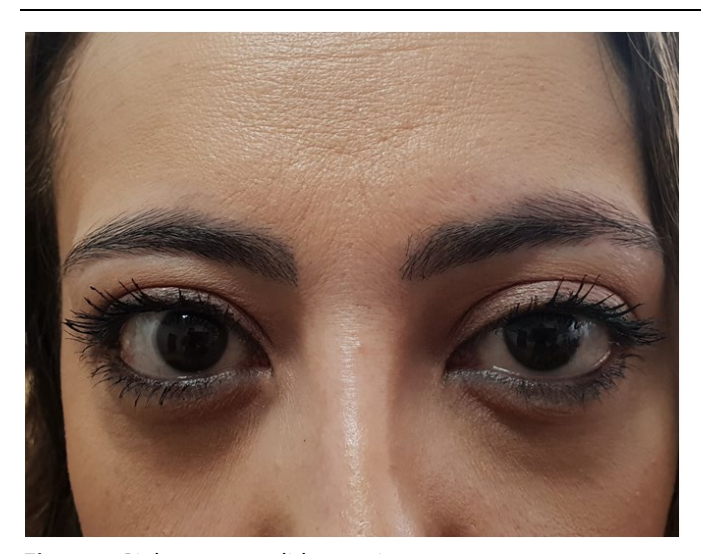
Figure 1. Right upper eyelid retraction