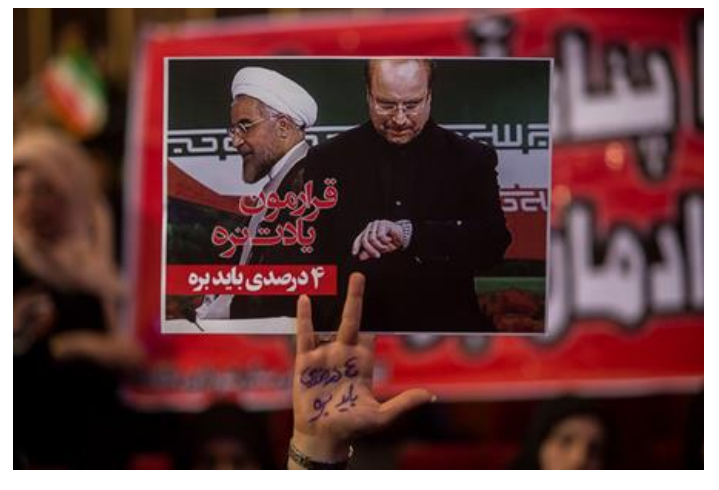
Image 8: One of Ghalibaf's posters in the 2017 election in the background of a photo ads (ISNA, 1396, {2}). In this poster, Hassan Rouhani is going and Qalibaf is looking at his watch. The text is: do not forget our promise: the 4% must go