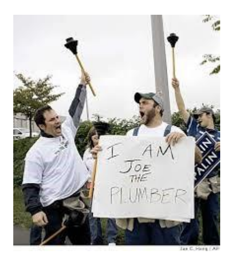
Image 5 : McCain fans who are dressed like Joe the Plumber (SFGATE, 2008)

Therefore, the image of Joe the Plumber as a symbol had different meanings during an electoral campaign, which in creating those meanings some elements such as the cultural context of the society, the public media capacities, the opportunism and intelligence of the publicity management teams of the candidates, and of course, Joe the Plumber's cultural luck and his desire to act were involved. Wazelbacher regularly attended conservative political gatherings all over the country, and standing up against taxes and against trade unions, and in favor of conservative family values. At the same time, the groups who were against these policies were engaging in mobilizing anti Wazelbacher scenarios and frequently found plumbers as the "real plumbers" and make them to speak against Joe Wazelbacher in order to mock him and the groups who invited him to attend their gatherings, and to discredit and mock them.