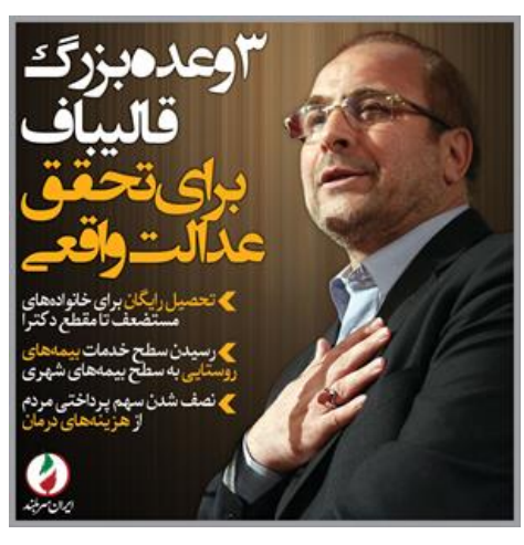
Image 7 : One of Ghalibaf's posters in 2017 election. This poster featured three great Qalibaf slogans: free education for the poors to Ph.D., Increasing the level of rural insurance to the level of urban insurance, and reducing people's fees for healthcare costs to 50%

These ups and downs were much less and weaker about Mirza Agha. In the 12<sup>th</sup> presidential election race, Hassan Rouhani's rivals, especially Mohammad Bagher Ghalibaf, tried to portray the image that Hassan Rouhani is not only the ordinary people and the majority of society's representative, but also represents the interests of a corrupt, rentier, and interest-seeking minority. Ghalibaf repeatedly used the term 4% for Rouhani in the televised debates and other public space and characterized himself as a representative of the other 96% of ordinary people who have been dominated and exploited that 4% (Rokna, 1396). He later on tried to feature himself as Ahmadinejad —who portrayed himself as a modest man which is a desirable norm between the mass- by presence among workers and the middle and lower classes of the society under the slogan "people's government", in order to depict himself as the public goodness and blessing and introduce Rouhani and his government as the representative of the public evil.