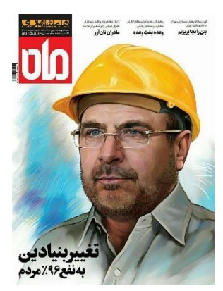
Image 9 : publicities in the official newspaper of the municipality of Tehran "Hamshahri" in favor of the Mayor's function (24onlinenews). The text is: A fundamental change in favor of 96% of the population