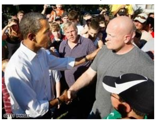
Image 4:. Obama's sincere meeting with Joe the Plumber (CNN, 2008) \,

But, the symbols and images will not remain under control of their creators. Three days later, during the last presidential election debate, John McCain kicked off the debate with Joe the Plumber in the first five minutes, and pointing him22 times separately during that night (YouTube (2008) {2}).