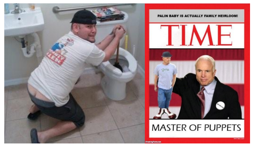
Image 6 : Examples of burlesque images of Joe the Plumbers made by McCain Opponents (freakingnews, 2008)