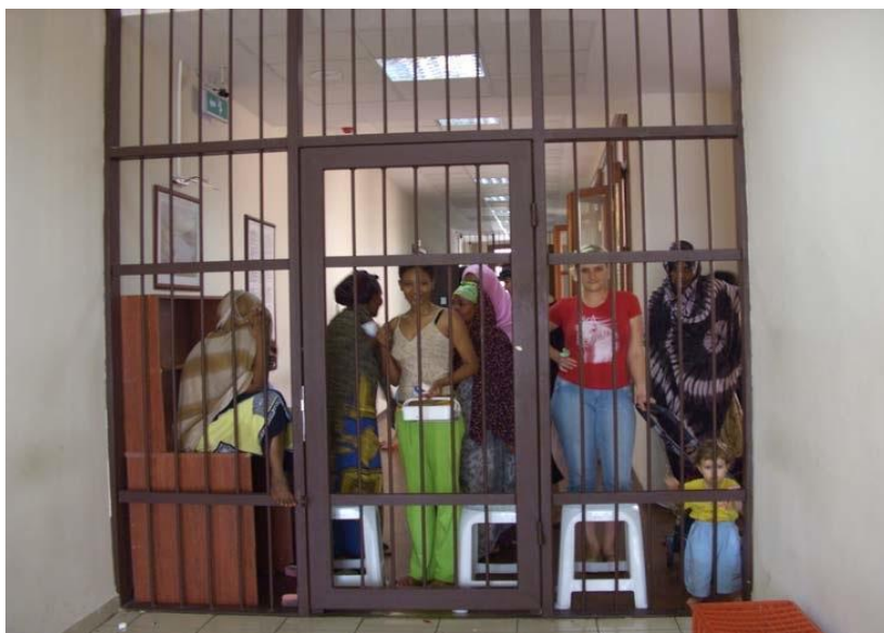
Figure 2. Female migrants in the Forigners' Guesthouse.

The branch manager for the guesthouse says that, the main problem for the migrants who stay here is that they did not have any passport documents with them when they got caught. It takes longer to deport those who do not have any documents with them, which makes them have to stay in the guesthouse even longer. Especially, if the country they come from does not have a consulate in our country, they have to stay here for a very long period of time. They periodically identify which countries they have such trouble with, and try not to catch too many people from those countries. If they do, they give them temporary residence permit and release them after a while. A superintendent in the guesthouse said that, the most innocent group of migrant people who do not get involved in illegal activities are the ones from Somali. He also added that, for many illegal migrants, Turkey is "a target country by obligation." In the houses which are rented by human smugglers, there are up to 80 people living in one house.