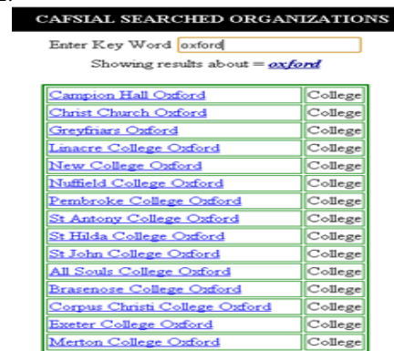
Figure 2. Screenshot - List of Suggested Organizations

The working of the automated CAFSIAL is explained in this section. CAFSIAL has a simple web based interface, and can be run in any of the web browser. User enters an organization’s name and related names are suggested by the system automatically. User enters the name or selects one form auto-suggested terms and searched button is pressed. Names of the organizations which match the user’s entered term are retrieved along the organization type and are displayed to user. For example, if user searches “Oxford”, he is provided with list of possible college (organization) resources to decide on as shown in figure 2.