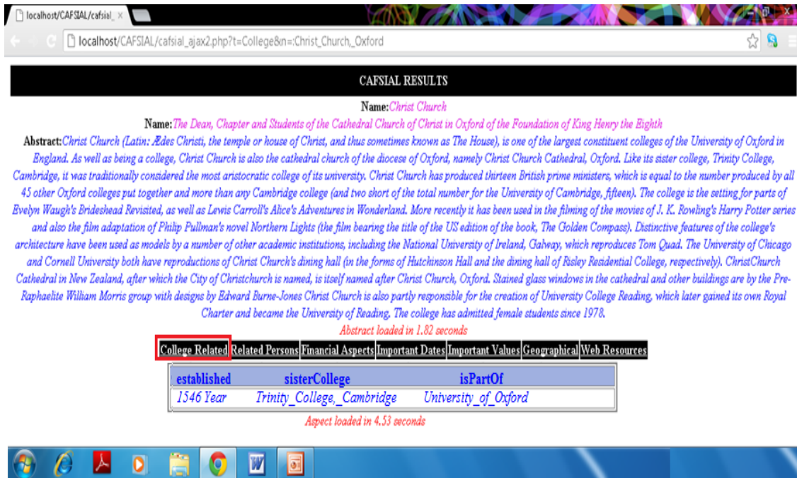
Figure 3. Screenshot of Result Presentation.

dump is being stored locally. This is notable improvement since the previous version of CAFSIAL was locally storing the DBpedia dumps. As the data is retrieved, at the same time similar properties are allied together to their relevant aspects using the already stored Domain and Range.