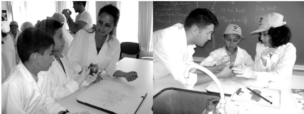
Figure 4 & Figure 5. The teachers' guiding for the students during the application

9. In the transactions process, students were guided by the research team (Figure 4, & Figure 5).