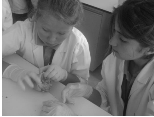
Figure 3. Implementation phase