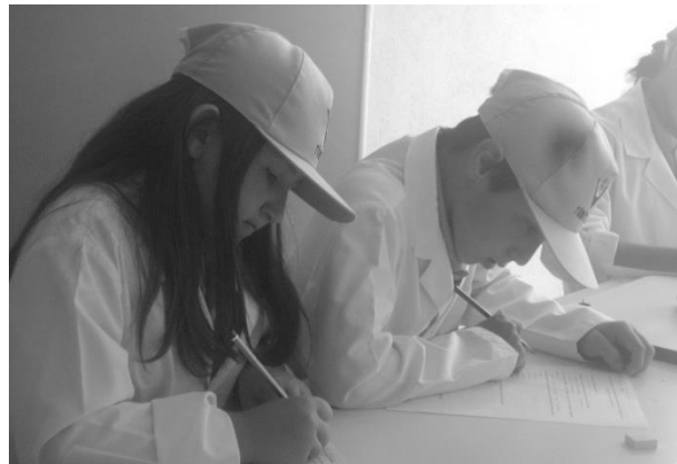
Figure 2. Pre-Test Application