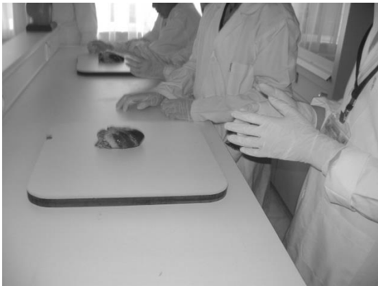
Figure 1. Pre-Activity Preparation