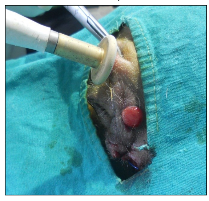
Figure 4. View of the ice formation of the whole tumor.

Freezing time was about 30 to 60 seconds. This was accomplished by ice creation over the whole tumor with at minimum 5-mm of independent margins (Figure 4). Technical achievement was noted as an elongation of the ice ball going further the tumor margin and post-ablation views indicating no contrast rise in the field of the original tumor 6 months following the primary procedure. Postoperatively, the patient was administered intravenous antibiotics for 72 hr. No visible tumor was defined by day 45, and no recurrence was observed till 2 years.