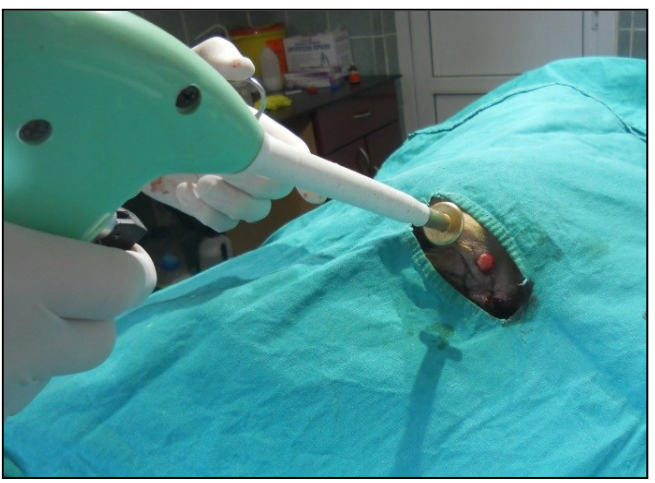
Figure 3. Application of cryoprobe to mass.

A probe with cytotherapeutic zones of 2 cm diameter was used in the study. The probe delivered liquid nitrogen, which did not come into contact with the ablated tissue. Being closed to liquid nitrogen flow allows for the thawing effect in the frozen cavity. Three cycles of freezing and thawing were induced, with the skin area being observed throughout (Figure 3).