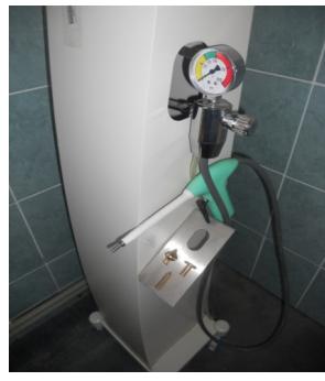
Figure 2. View of criosurgery equipment.

The dog was premedicated with xylazine HCl (2 mg kg-1, IM, Alfazin®, Turkey). The probe-based cryosurgical system (Üzümcü, Istanbul, Turkey) was used for cryoablation using a local anesthetic (Industrial Ave, Molendinar, Australia) as the interface for uniform freezing. This system was comprised of a tube of liquid nitrogen (-195 °C) and a probe (Figure 2).