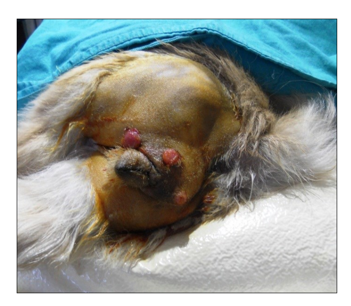
Figure 1. View of nodules in perianal region.

diameters were 1.8, 1.5, and 1.2 cm. In cross section, the nodules were whitish-yellow in colour, of solid consistency, and characterized by thickening of the skin. The dog had not previously undergone surgical removal of tissue.