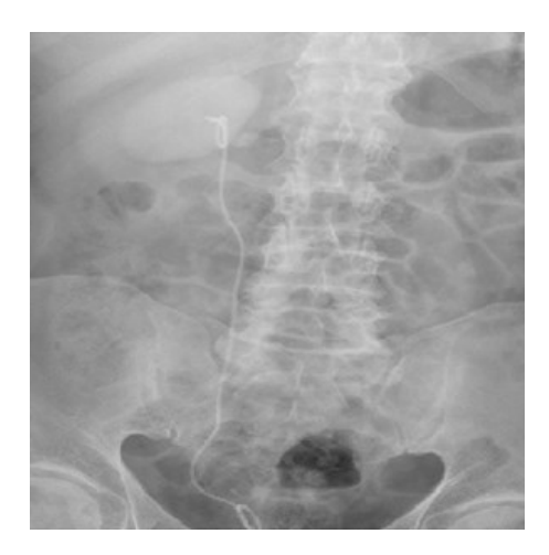
Figure 3. KUBG in Postoperative First Day