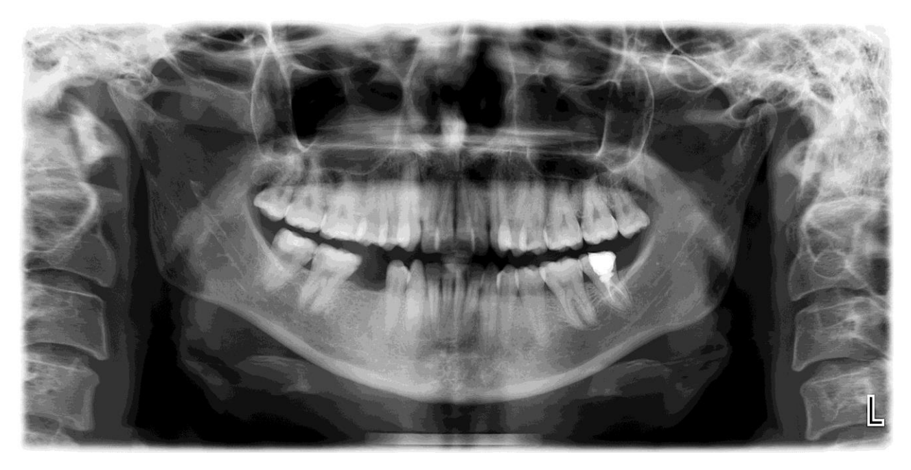
Figure 3: Multilocular PAE on the right and unilocular PAE on the left.