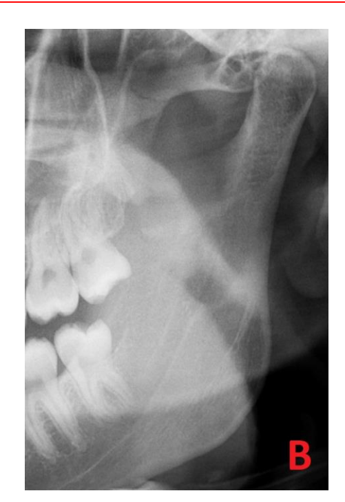
Figure 2: Unilocular (A) and multilocular type (B) PAE