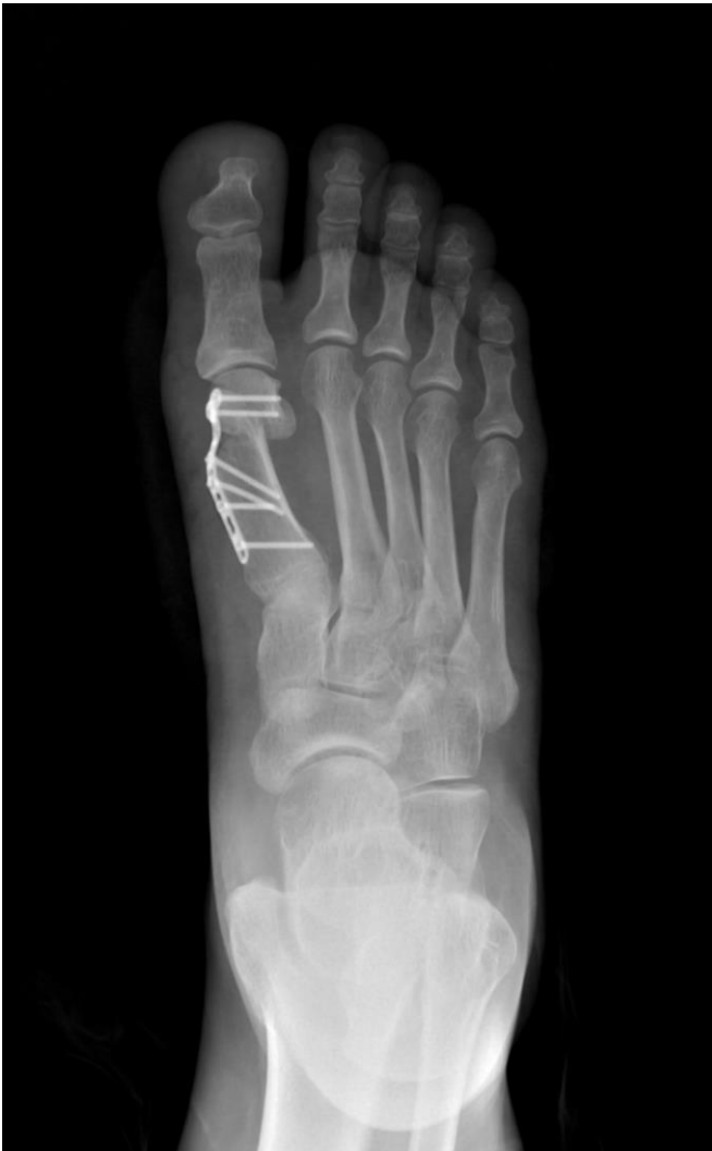
Figure 3: Anteroposterior radiograph of the foot after distal metatarsal chevron osteotomy fixedated with a locking plate.