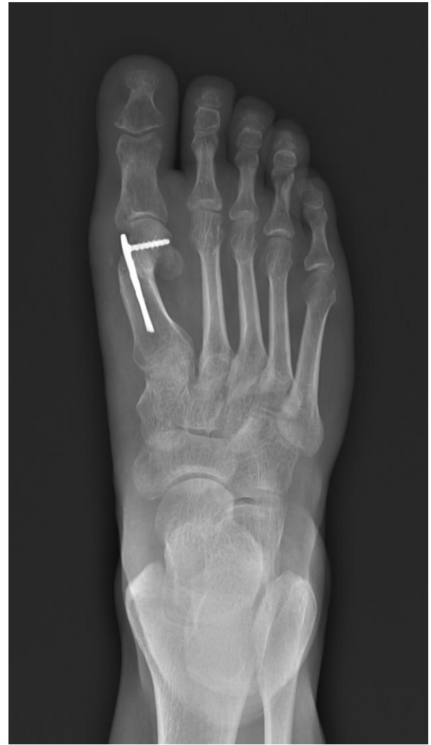
Figure 5: Anteroposterior radiograph of the foot after distal metatarsal chevron osteotomy fixed with an intramedullary device.