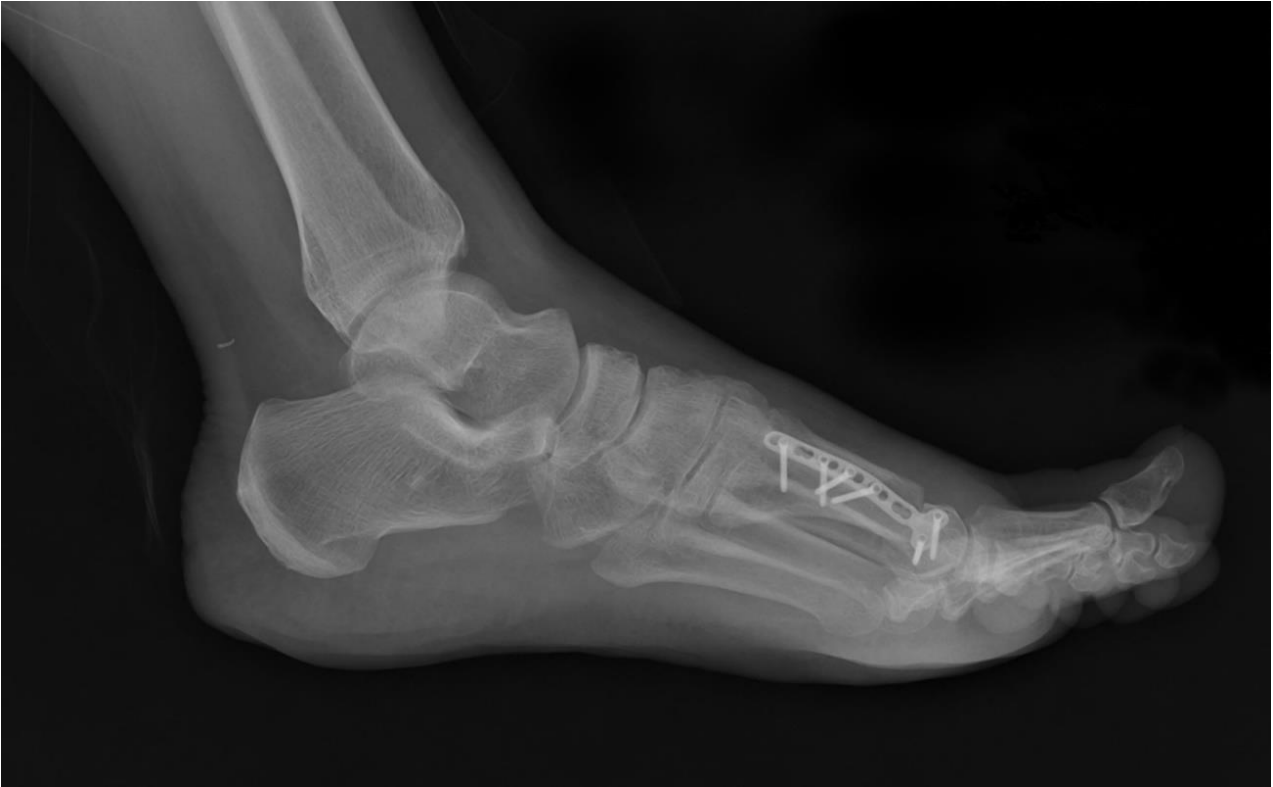
Figure 4: Anteroposterior radiograph of the foot after distal metatarsal chevron osteotomy fixedated with a locking plate.