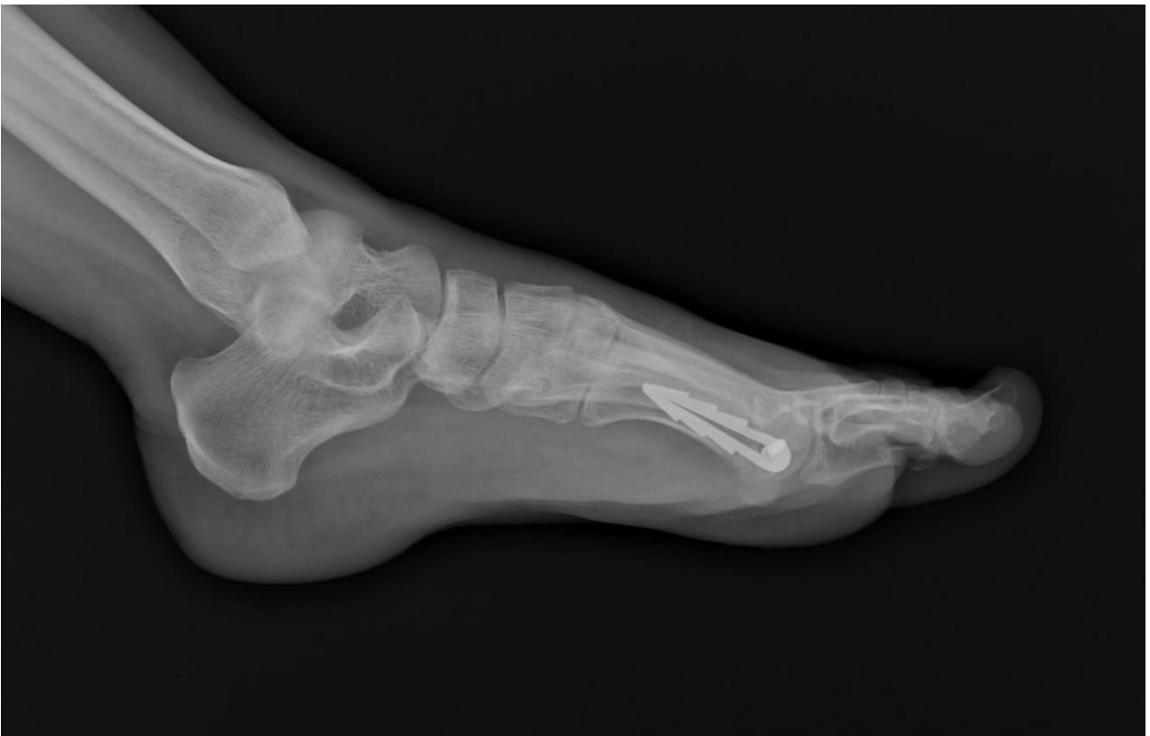
Figure 6: Anteroposterior radiograph of the foot after distal metatarsal chevron osteotomy fixedated with an intramedullary device.