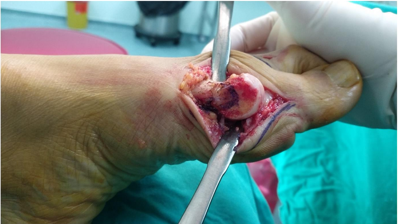
Figure 2: Intraoperative photograph of the chevron osteotomy. Blue lines represent the chevron osteotomy line in the metatarsal head.

In the intramedullary device group, Hallux Osteotomy Locking Plate (HOL) ™ (ITS GmbH, Graz, Austria) was used (16). After the osteotomy, the capital fragment was translated laterally approximately 50% of the width of the osteotomy line in the first metatarsal bone and a temporary K-wire fixation was achieved from dorsal to palmar direction. Fluoroscopic image was obtained to ensure the lateral shift of the metatarsal head. Next, the stem of the intramedullary device was inserted into the intramedullary canal of the first metatarsal bone in the appropriate size. The sleeve of the locking screw bolt was attached to the stem and the